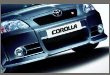
Optional front spoiler.