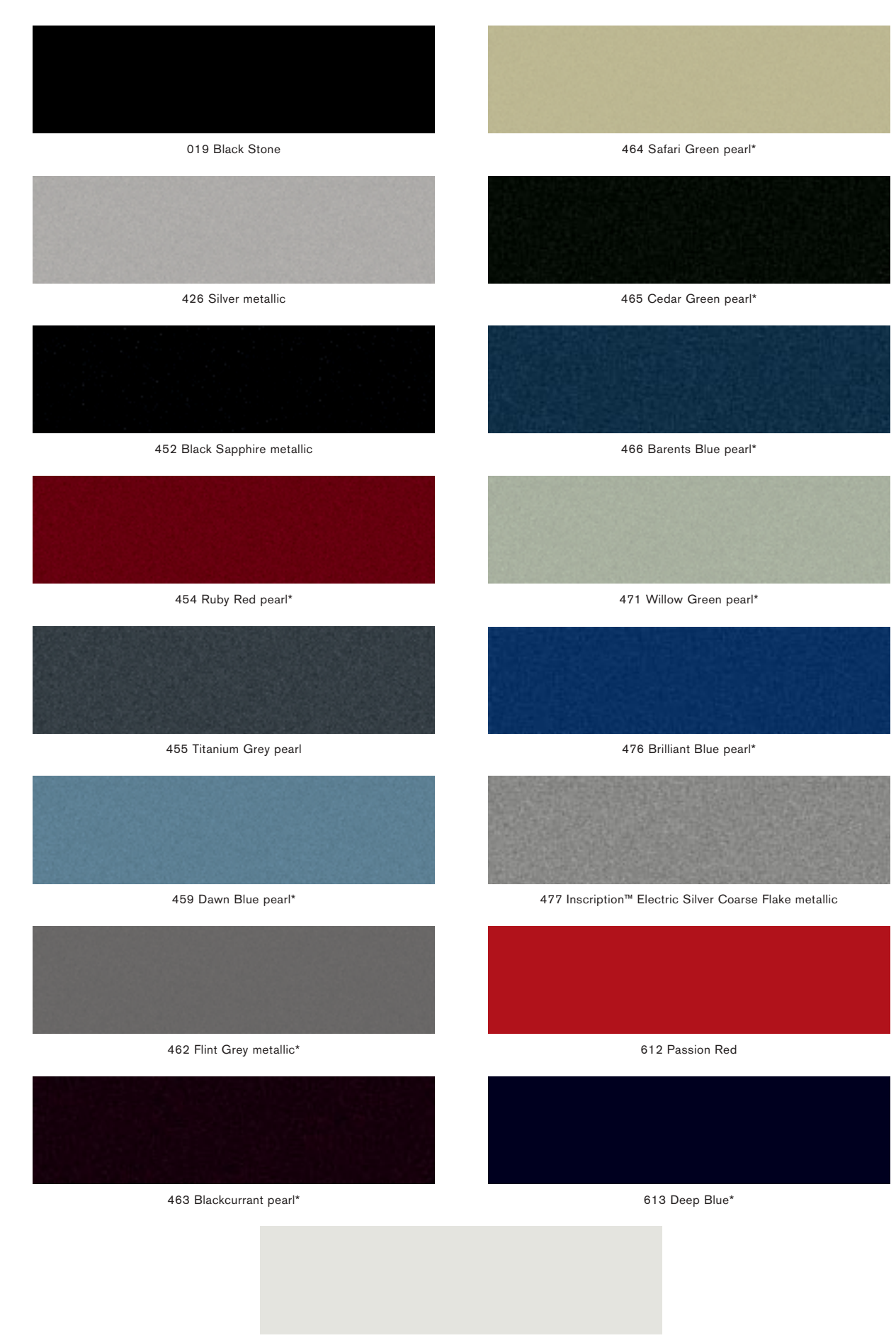
614 Ice White*