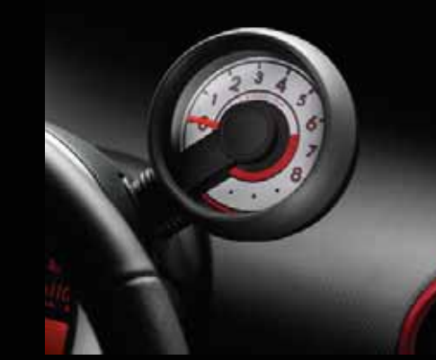
Leather-trimmed steering wheel