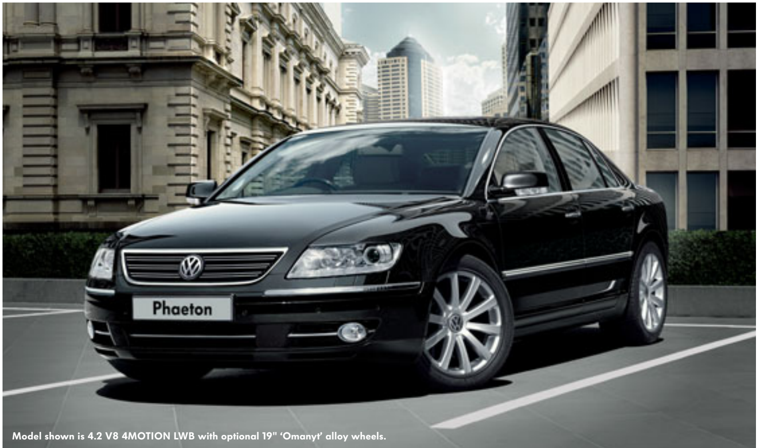
Model shown is 4.2 V8 4MOTION LWB with optional 19" 'Omanyt' alloy wheels.