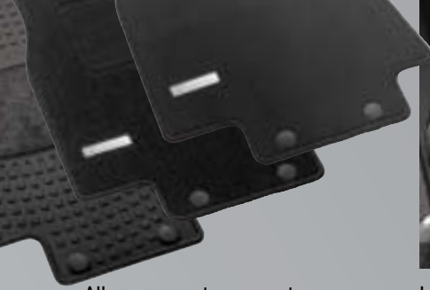
All-season mats, rep mats, velour mats

Durable, hardwearing materials. Available in various colours to match the interior. Can be clip-fastened to the floor of the vehicle to prevent slipping