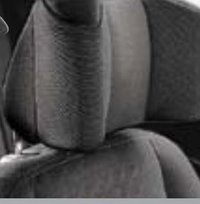
Luxury head restraint cover Anthracite. For the head

Durable, hardwearing materials. Available in various colours to match the interior. Can be clip-fastened to the floor of the vehicle to prevent slipping