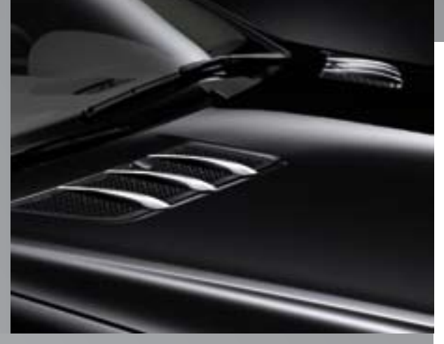
Fin attachments for bonnet High-sheen chromed. Available as a 6-piece set

A brilliant outlook, we're sure you'll agree.