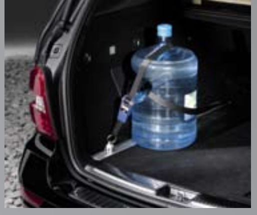
Tie-down strap Even heavy objects can be secured in place easily using this strap