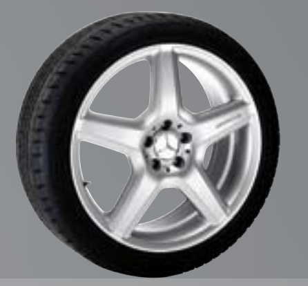
AMG 5-spoke wheel | Style VI AMG light-alloy wheel | Finish: silver, high-sheen Wheel: 10 J x 20 ET 46 | Tyre: 295/40 R20

AMG 5-spoke wheel | Style III AMG light-alloy wheel | Finish: silver, high-sheen Wheel: 9 J x 21 ET 60 | Tyre: 265/40 R21 Option for rear axle: Wheel: 9 J x 21 ET 48 | Tyre: 265/40 R21