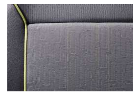
Trip cloth trim