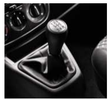
5-speed manual gearbox

On diesel and petrol engines the Bipper Tepee comes with a 5-speed manual gearbox. On the HDi diesel engine, a 5-speed electronically-controlled gearbox offers greater convenience for urban use.