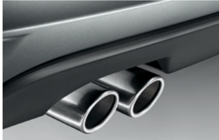
Image shown is for illustration purposes only and may not necessarily reflect UK specification.

The distinctive twin exhaust tailpipe is eye-catching and gives off a purposeful sound on the road.