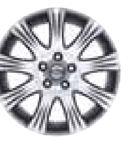
17" Cassini (Silver Bright)