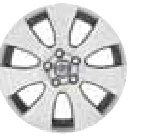
17" Spartes (Silver Stone)