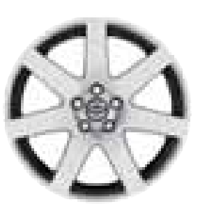
18" Venator (Chromed)