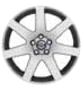
18" Venator (Silver Bright)