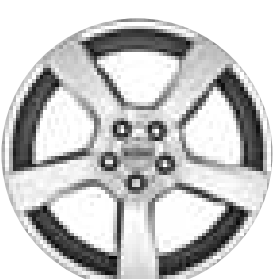
18" Cratus (Silver Bright)