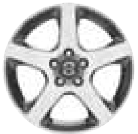
17" Canicula (Silver Bright)