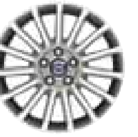
17" Regor (Silver Bright)