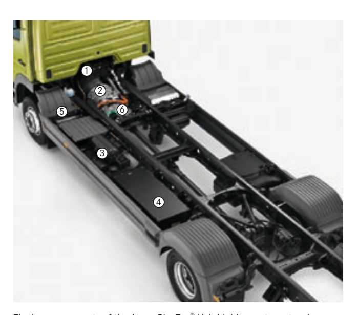
The key components of the Atego BlueTeo® Hybrid drive system at a glance: 1. Diesel engine 2. Electric motor/alternator 3. Inverter (below equipment carrier) 4. Lithium-ion battery 5. Hybrid cooling system for electric motor/alternator and inverter 6. Automated transmission with Telligent® automatic gearshift

The Atego BlueTec® Hybrid is equipped with a diesel engine and, in addition, an electric motor. They can power the Atego individually or together. The electric motor draws its energy from a lithium-ion battery, which is charged mainly during braking - through the conversion of kinetic energy into electrical energy. When starting off, for example, the Atego BlueTec® Hybrid is driven by the electric motor, thus ensuring quiet, fuel-efficient and low-emission operation. The internal combustion engine is merely idling during this time. In many other driving situations, too, the Atego reduces fuel consumption and CO<sub>2</sub> emissions. When accelerating, for example, as the already economical Euro 5 engine saves fuel thanks to the assistance provided by the electric motor and therefore operates even more efficiently. What's more, the standard-fit engine start/stop system stops the engine automatically when the vehicle is halted at traffic lights, for example, before restarting it when the vehicle is ready to move off again. This system likewise reduces fuel consumption and CO<sub>2</sub> emissions.