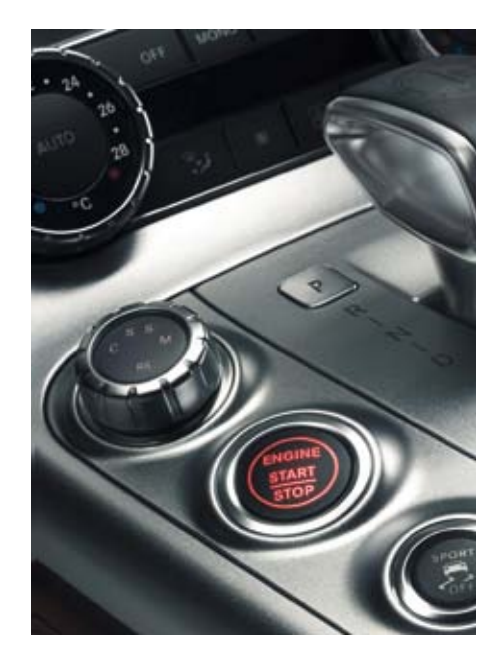
AMG Drive Unit with E-Select shift lever and Keyless-Go