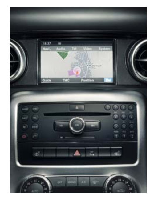
Standard equipment 7-inch TFT colour screen for displaying high-resolution maps