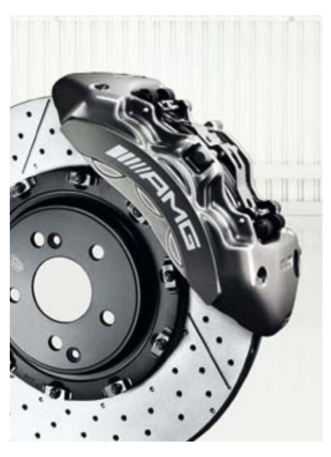
AMG high-performance composite braking system