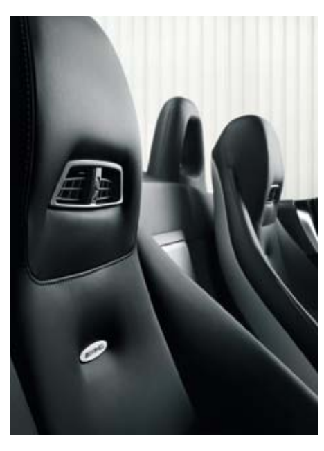
Airscarf neck-level heating system