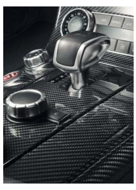
AMG carbon-fibre interior trim