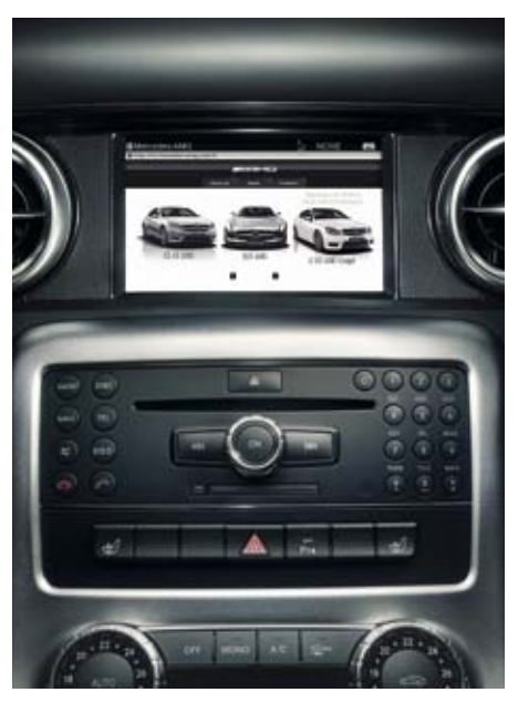
Optional extra AMG Performance Media: internet function