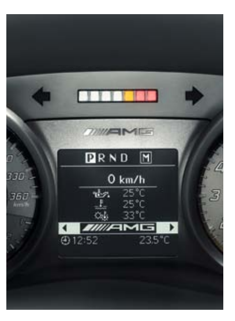
AMG instrument panel with 7-LED upshift indicator