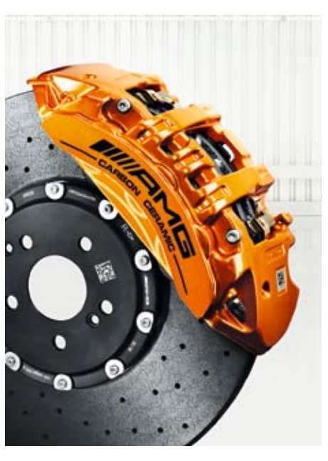
AMG high-performance ceramic composite braking system