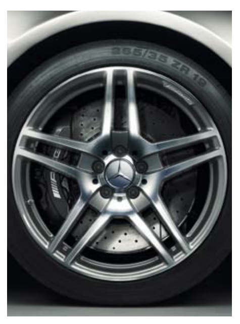
Optional extra AMG 5-twin-spoke alloy wheels with burnished Titanium Grey finish