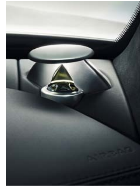
Optional extra Bang & Olufsen BeoSound AMG with illuminated tweeter lenses