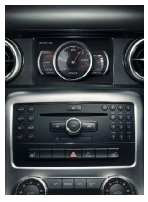
Optional extra AMG Performance Media: torque, output and accelerator position data