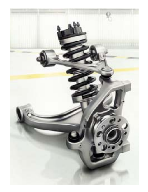
AMG Ride Control sports suspension