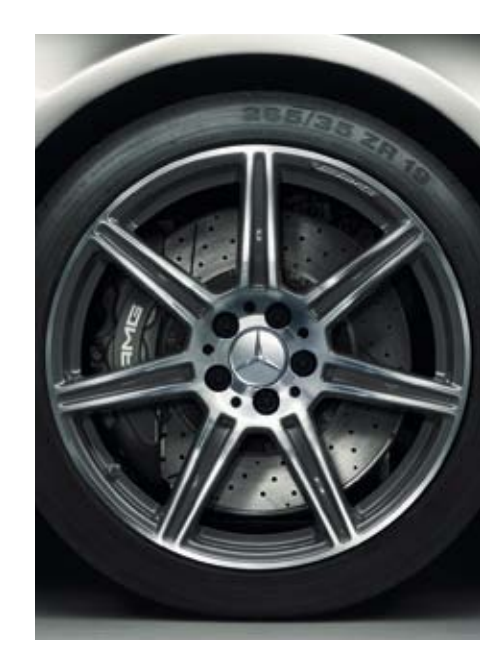
Standard equipment AMG 7-spoke alloy wheels with burnished Titanium Grey finish