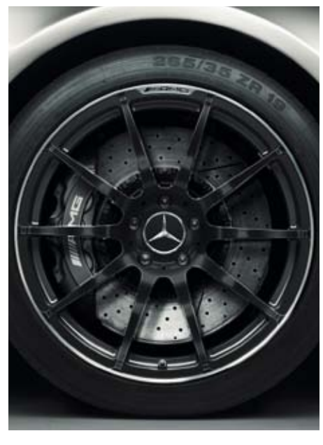
Optional extra AMG 10-spoke forged alloy wheels with Matt Black finish and burnished rim