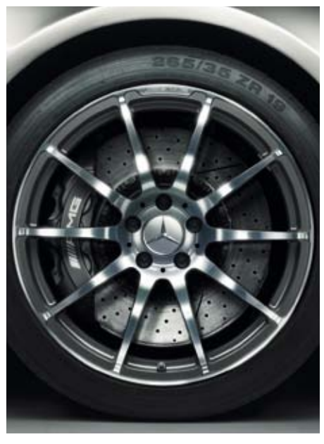
Optional extra AMG 10-spoke forged alloy wheels with burnished Titanium Grey finish