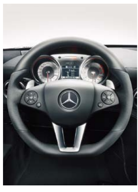
AMG performance steering wheel in nappa leather/Alcantara®