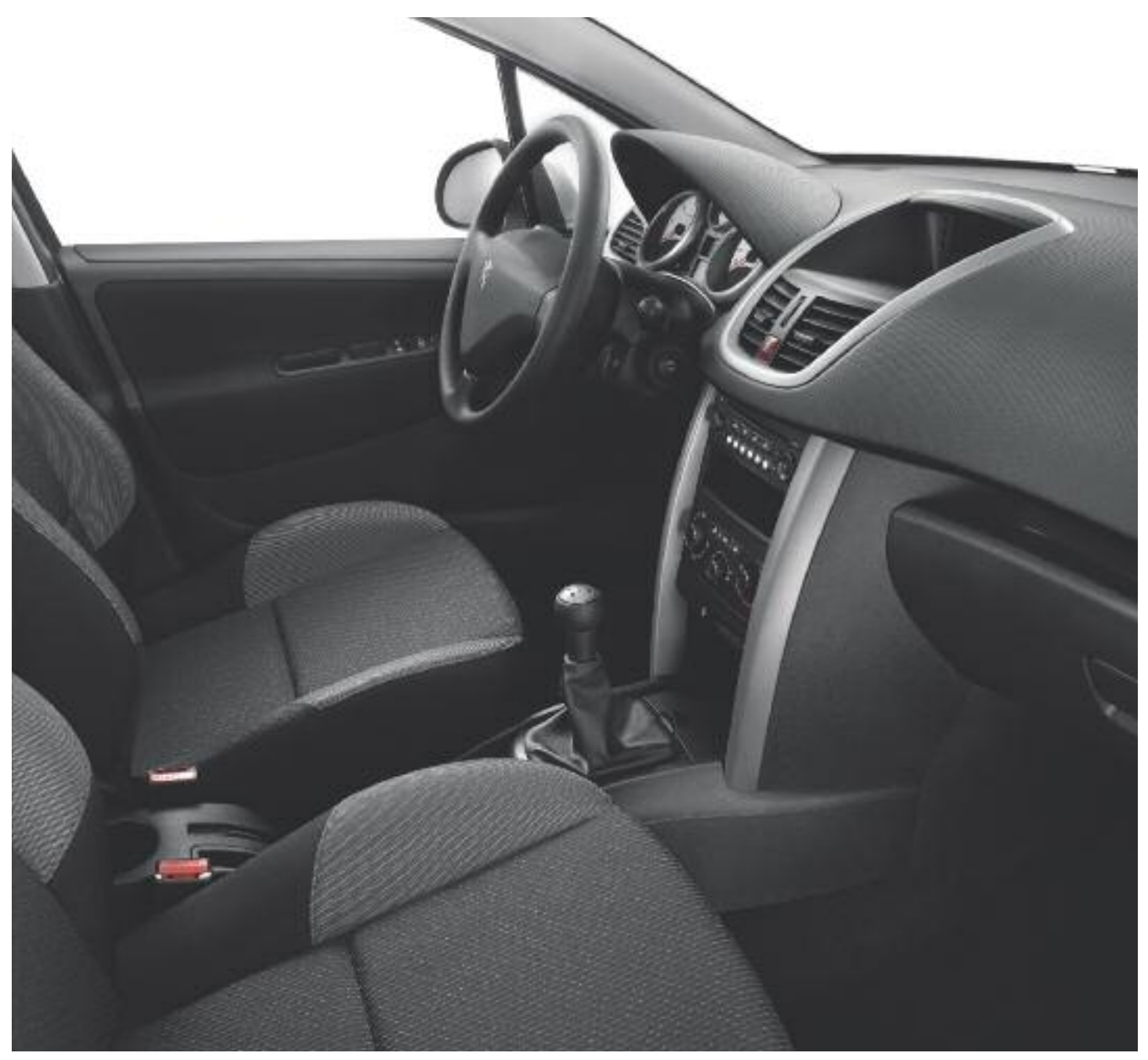
Mistral Cloth Trim* *Available on Hatch-back and SW, according to versions.