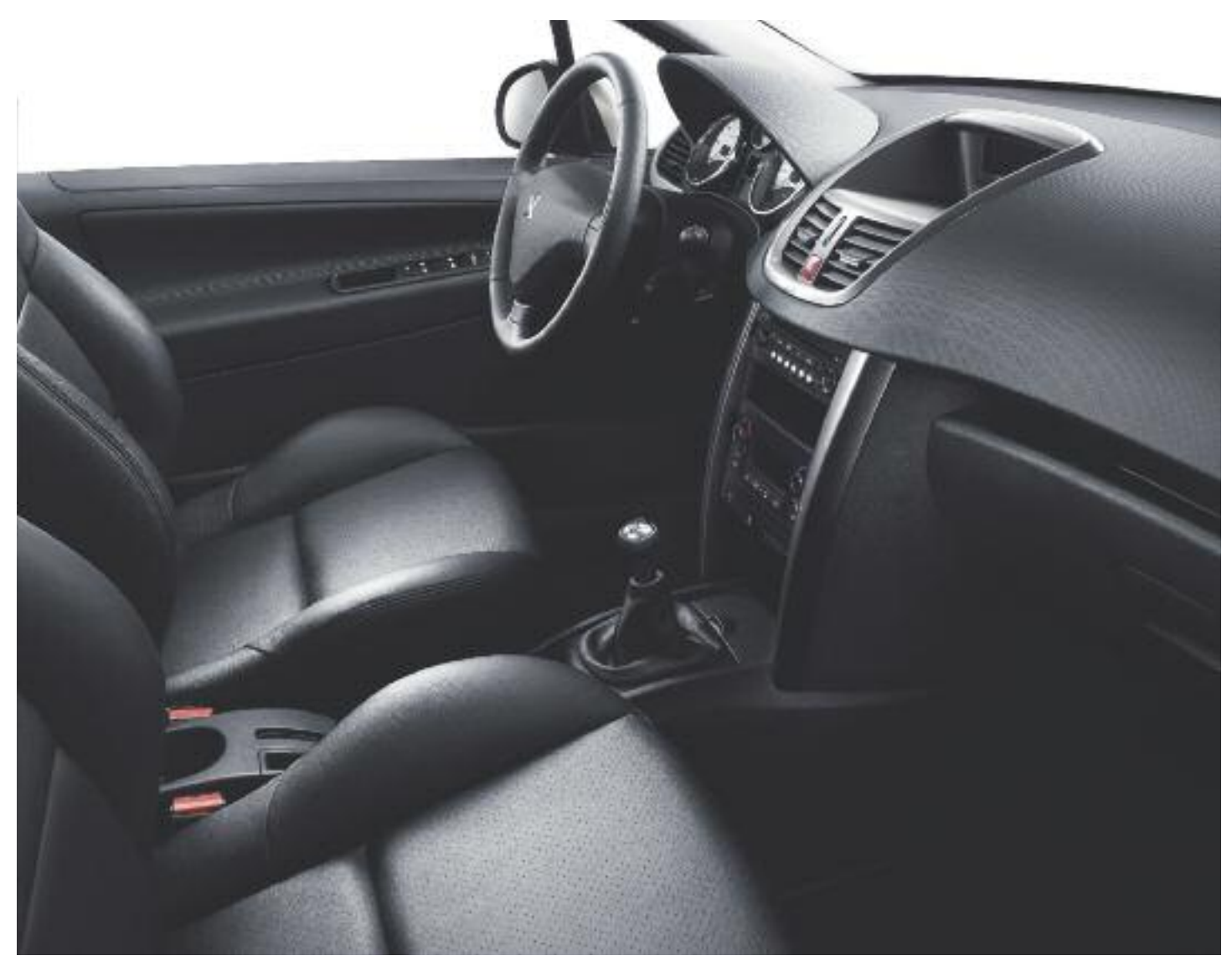
Optional Perforated Mistral Black Leather* *Available on Hatchback and SW, according to versions.