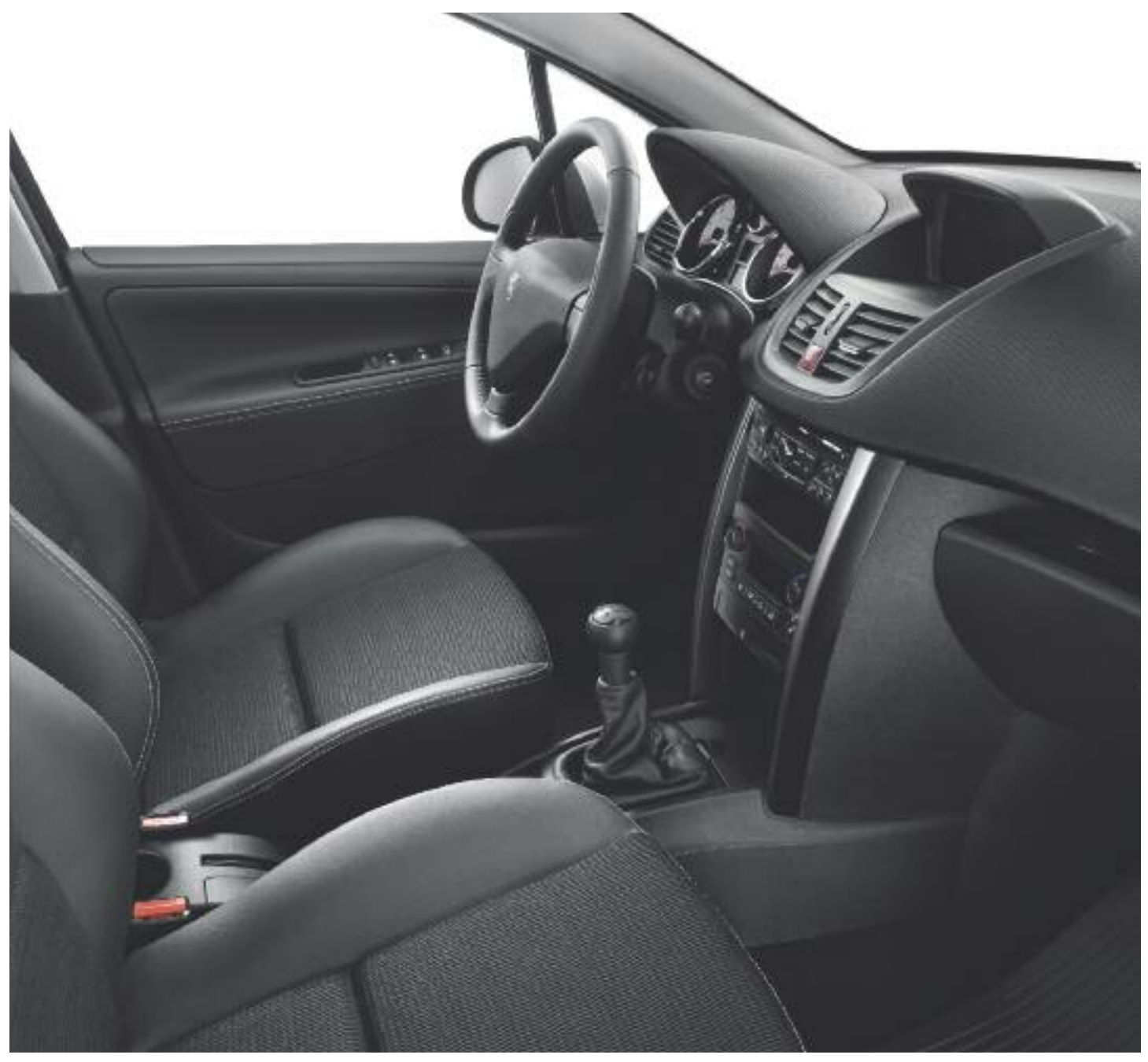
Aspen Cloth Trim* *Available on Hatch-back and SW according to version.