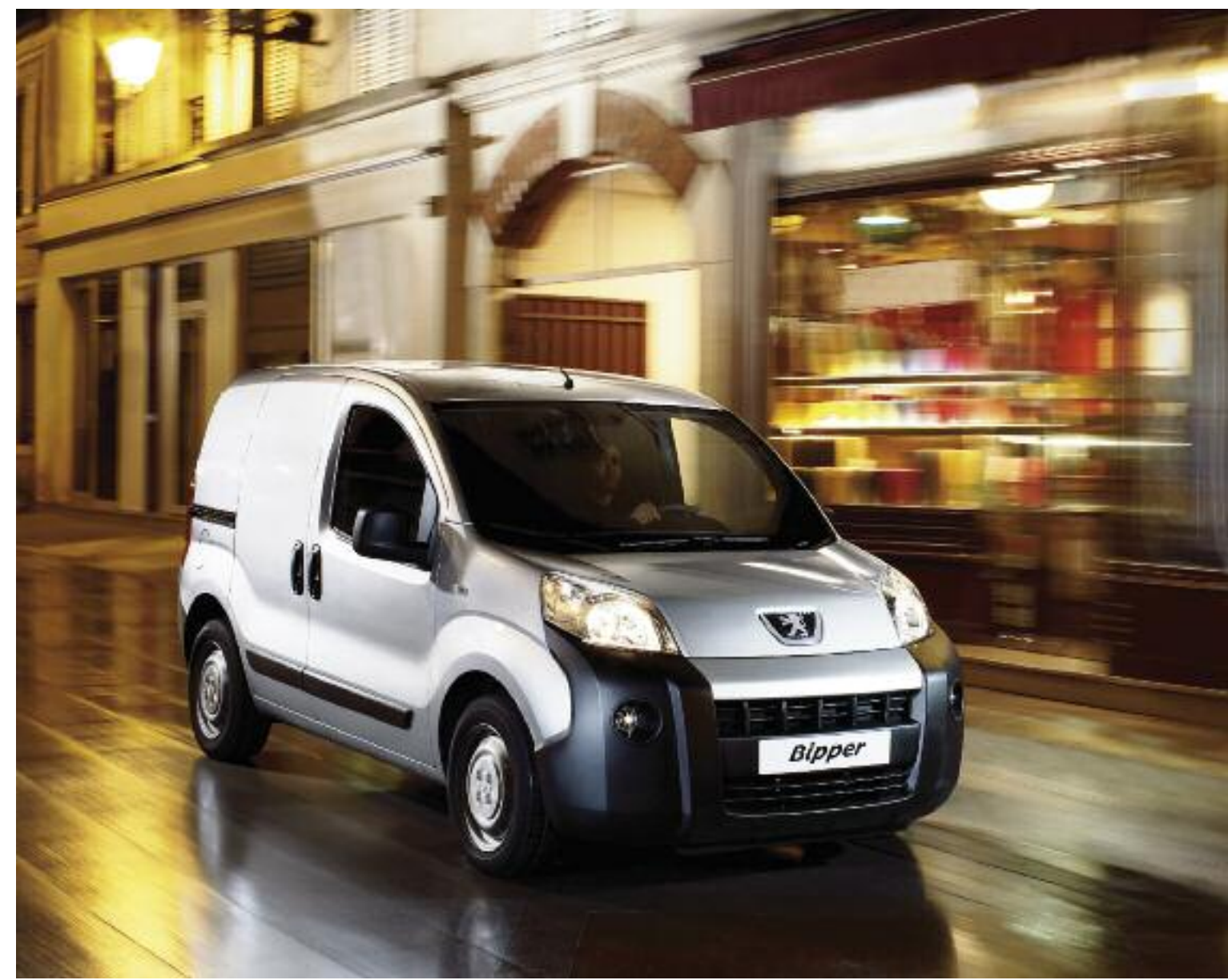
* Designed for the city.