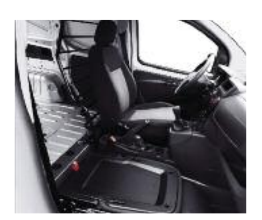
Multi-Flex retractable seat freeing up additional space

On the Bipper, access to the load compartment is made easier by the the two rear doors which open to 90°. A clever Multi-Flex retractable check strap system allows them to be opened to 180° for even greater convenience.