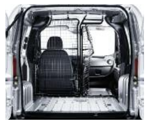
Modular partition linked with the retractable passenger seat**