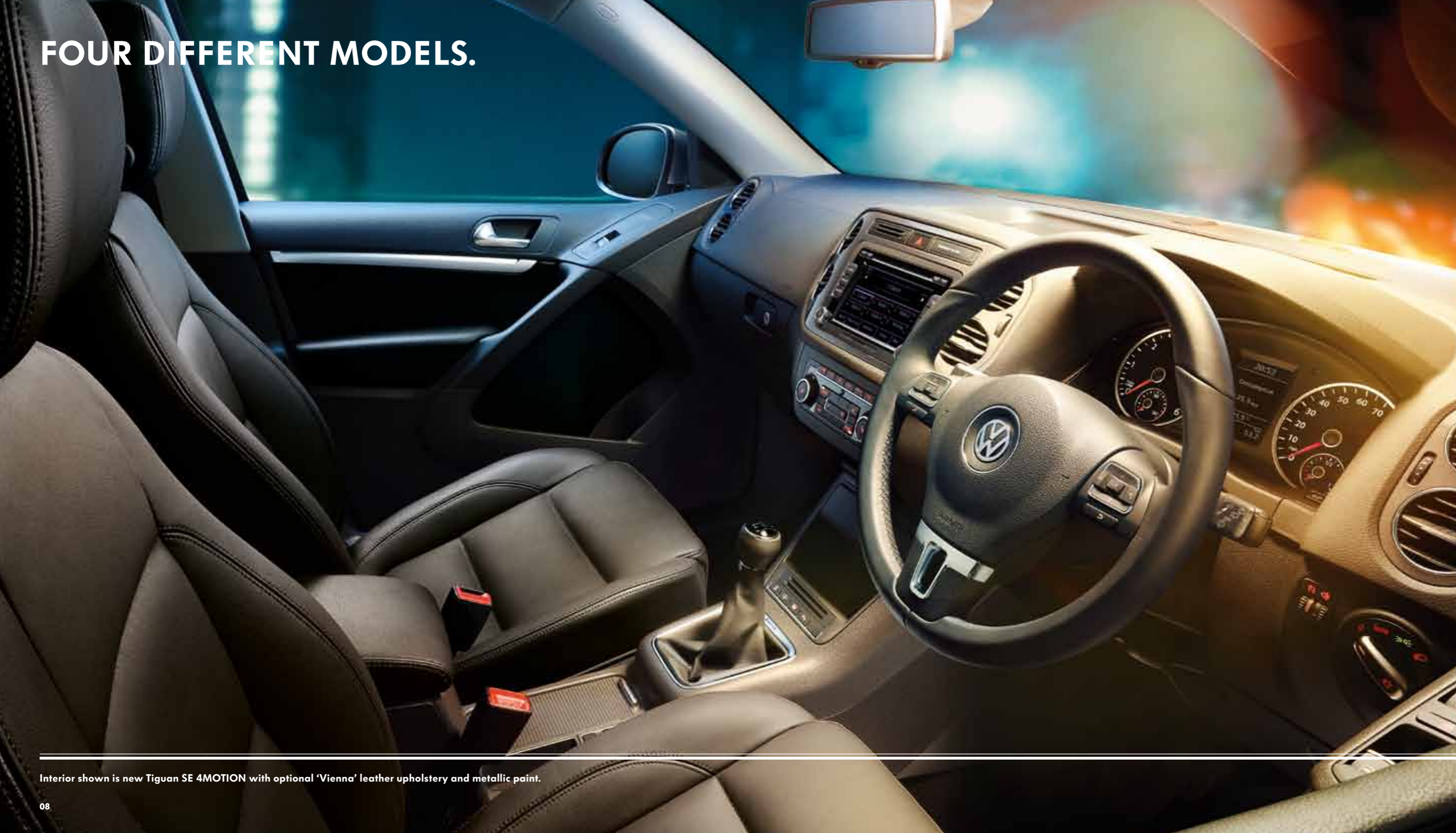
Interior shown is new Tiguan SE 4MOTION with optional 'Vienna' leather upholstery and metallic paint.