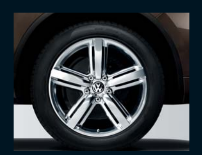
'Metropolitan' 9J x 20 alloy wheels.

The exterior styling of a car is not only an expression of its personality, but makes a powerful statement about your own individuality and taste. These factory-fitted options provide an easy and effective way to create a striking visual appearance with great aesthetic appeal, while enjoying some important practical benefits. From a retractable towbar to Bi-Xenon headlights, choose the options best suited to your needs and enhance not only your new Touareg's exterior looks, but your driving experience too.