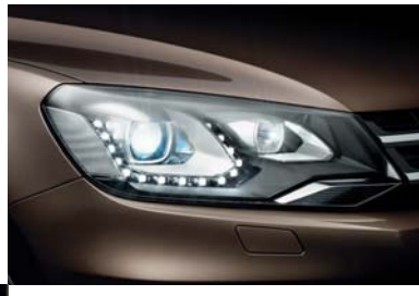
Gas discharge (Bi-Xenon) dipped and main beam headlights.

The interior of your car is all about aesthetics and luxury, which is why choice of finish, trim and upholstery is so important. A choice of the finest quality 'Vienna', 'Nappa' or Alcantara leather upholstery enables you to create a sumptuous interior that is tasteful, elegant and attractive, meeting your individual needs perfectly, and providing the highest levels of comfort and driving pleasure. Sit back, relax and enjoy your surroundings.