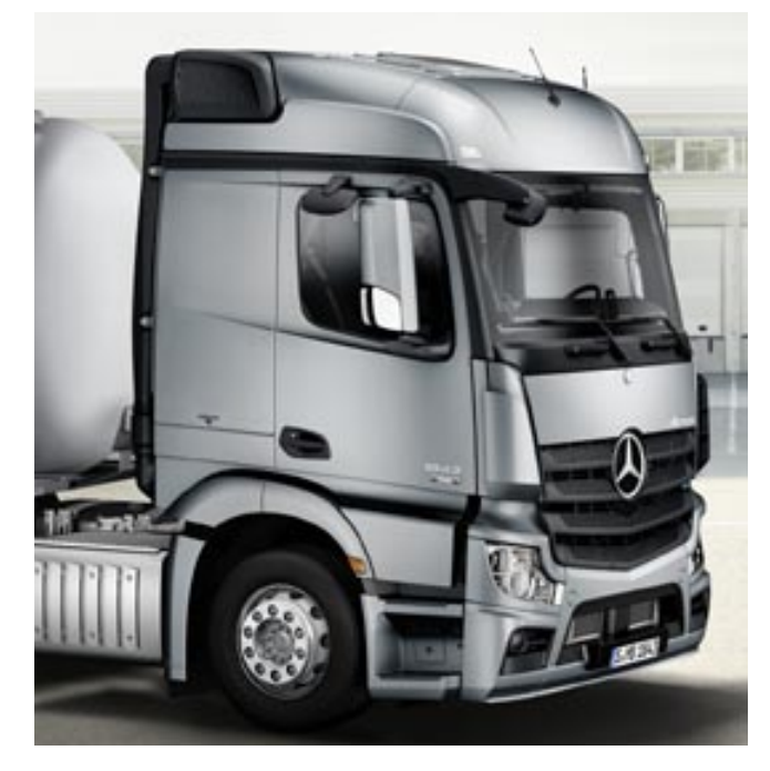
Just one of many weight-reducing measures: in order to make the Actros Loader even lighter, the cab will be delivered without external access to the storage lockers unless specified

1) Tractor units available with power output of 235 kW (320 hp) and above