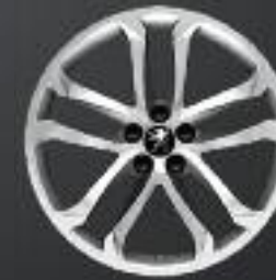
19" Solstice - anthra grey