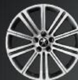
18" Original - dark grey