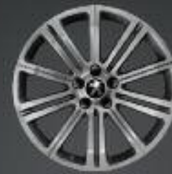
18" Original - spirit grey