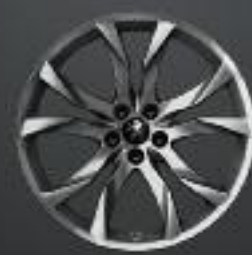
19" Sortilège - midnight silver