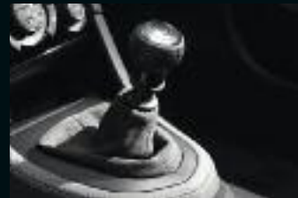
Sports gear lever