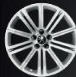
18" Original - silver

A range of optional alloy wheels are available on RCZ. Stylish and sporty, 18" and 19" versions are available. Refer to price and specification guide for details.