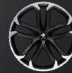
19" Solstice - matt black

* Note: 18" options available on Sport. 19" options available on GT.