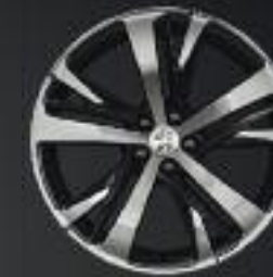
19" Technical - storm grey