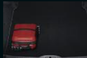
Trunk mat and wedges