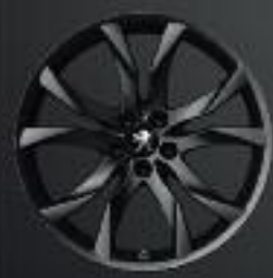
19" Sortilège - matt black