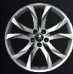
19" Sortilège - silver