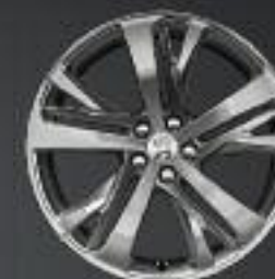
19" Technical - hephais light grey