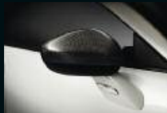
Door mirror covers