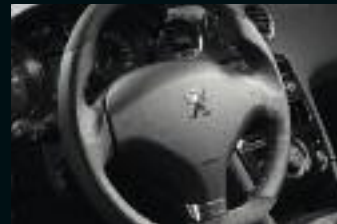
Soft touch sports steering wheel

Note: Some products are standard on GT level of New RCZ. Refer to price and specification guide or ask your Peugeot dealer for details.