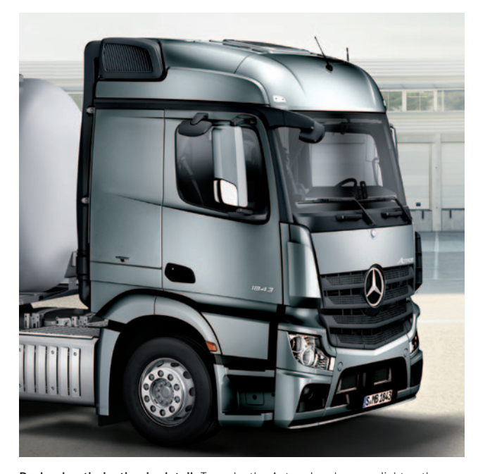
Payload optimisation in detail. To make the Actros Loader even lighter, the cab is only equipped with an exterior stowage compartment door on the right upon request.

Payload optimisation ex factory. A whole range of major and minor weight-reducing measures on all Loader vehicles ensure that you can carry more payload on every trip in long-haul, distribution or construction transport operations. To give you maximum flexibility in configuring the vehicle, some measures can also be deselected. In short, you decide for yourself the extent to which you wish to exploit your Loader's payload potential for particularly profitable operations with an extremely low kerb weight or rather with an emphasis on comfort. Driving comfort features as standard for all Actros and Antos Loader vehicles thanks to a broad selection of job-matched cabs measuring 2300 mm in width and Mercedes PowerShift 3 with 12-speed direct-drive transmission<sup>2)</sup>. Semitrailer tractors feature aluminium wheels fitted with super-wide tyres as standard. What's more, the full range of safety and assistance systems is available to ensure that a Loader is not only particularly economical in operation, but also especially safe.