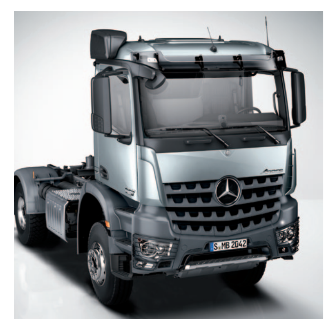
Arocs Loader semitrailer tractor. Despite the low kerb weight of the Arocs Loader semitrailer tractors, a solid, heavy-duty vehicle design with robust chassis and suspension components forms part of the standard specification.

This is particularly crucial for the Arocs Loader 8 x 4/4 concrete mixer, which also offers optimum traction in off-road use with its widened hypoid rear axles and its tyres offering particularly high load-bearing capacity.