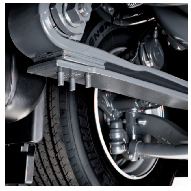
Weight-optimised parabolic springs. Low kerb weight, high load-bearing capacity and high ride and suspension comfort are not mutually contradictory features but advantages resulting from the two-leaf front springs on 4-axle Arocs Loaders.