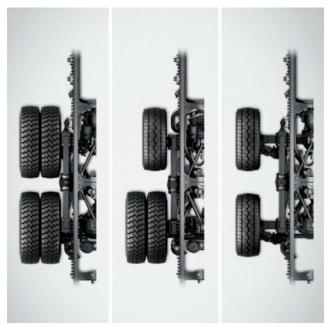
Payload-optimised tyre concepts. To enable the transportation of 8 m³ of ready-mixed concrete, the Arocs Loader 8 x 4/4 concrete mixer is equipped with two widened hypoid rear axles for singe tyres and 385/65 R 22.5 wide tyres offering particularly high load-bearing capacity.