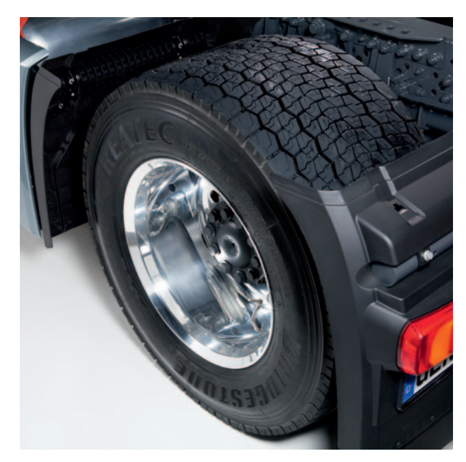
Super-wide tyres. Loader vehicles in long-haul and distribution transport are fitted as standard with super-wide tyres on aluminium wheels. In addition to the higher payload capacity, this also contributes to reduced tyre wear and low fuel consumption.

Loader engines. Actros and Antos Loader semitrailer tractors are powered by Euro VI engines in the 7.7I displacement category in output ratings beginning at 235 kW (320 hp)<sup>3)</sup>. Depending on the model variant, nine efficient 6-cylinder in-line engines are available in all for payload-sensitive long-haul and distribution transport operations, with outputs ranging between 175 kW (238 hp) and 315 kW (428 hp).