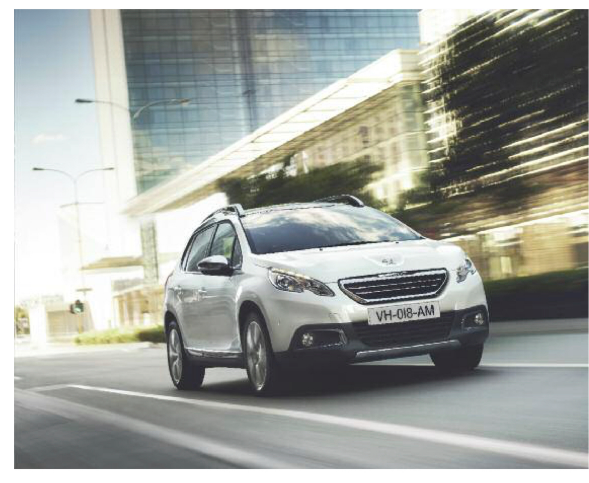
PEUGEOT 2008 CROSSOVER