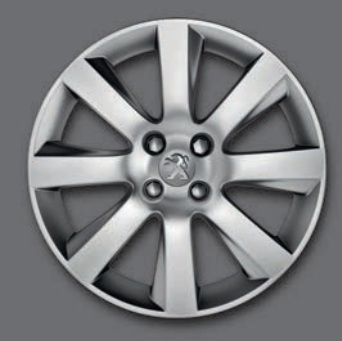
3" Ixion alloy*