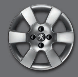
16" Eris alloy*