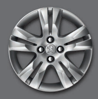
7" Ouark allou*