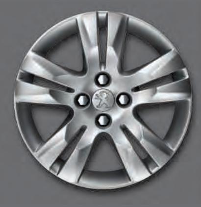
17" Quark alloy*