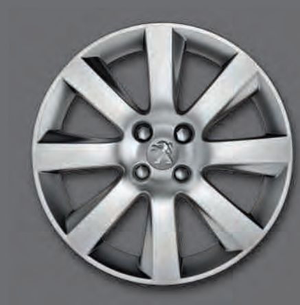
18" Ixion allou