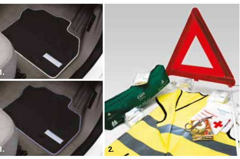
1. Premium mats: Available in two different colours to harmonise with your car colour choice, these made to measure carpet mats will protect your car's carpet. 2. Safety kit: Complete kit including a warning triangle, a thermal blanket, a vest and a first aid kit.