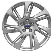
Taranis, 7,5x18" Silver