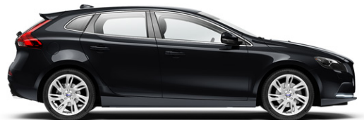
717 Onyx Black metallic (Also available for R-Design)