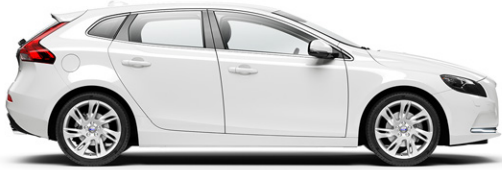
614 Ice White (Also available for R-Design)