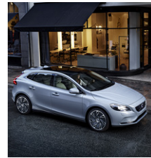
ACCESSORIES PAGE 28