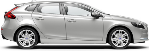
711 Bright Silver metallic (Also available for R-Design)