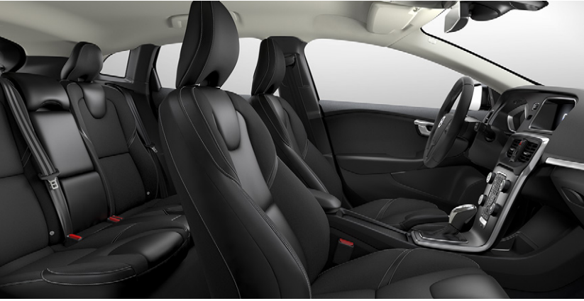
Textile/T-Tec P500 Charcoal interior with Blond headlining