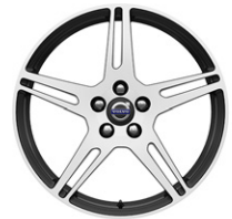
Ymir, 7,5x18" Diamond Cut/Glossy Black