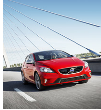
YOUR NEW CAR PAGE 04