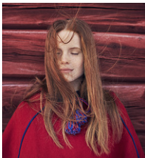
THE VOLVO EXPERIENCE PAGE 32