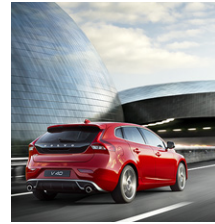
R-DESIGN PAGE 20