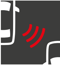
INTELLISAFE PAGE 14