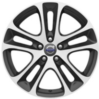
Atreus, 7,5x18" Diamond Cut/Dark Grey