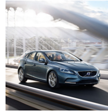
SENSUS PAGE 12