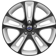
Atreus, 7,5x18" Diamond Cut/ Glossy Black and white