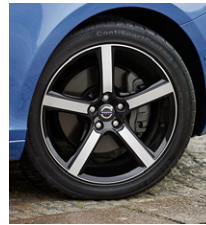
ALUMINIUM WHEELS PAGE 26