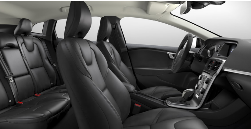
Leather, P100 Charcoal interior with Blond headlining