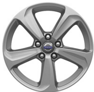
Segomo, 7,5x17" Grey