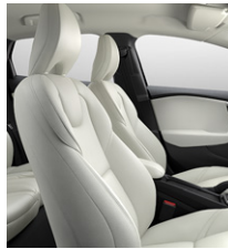
UPHOLSTERIES PAGE 24