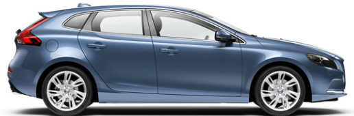
713 Power Blue metallic (Also available for R-Design)