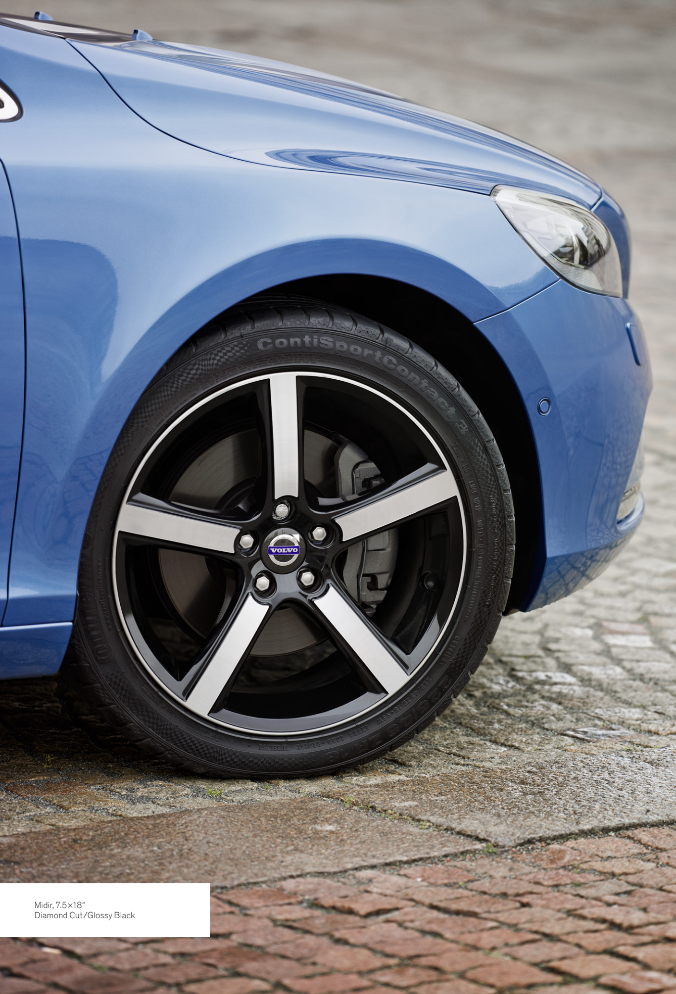
Midir, 7.5x18" Diamond Cut/Glossy Black