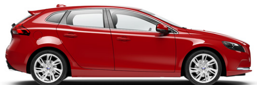
612 Passion Red (Also available for R-Design)

N.B Some information may have been updated since this brochure was printed. Some of the equipment described or shown may now be available only at extra cost. Before ordering, please ask your Volvo dealer for the latest information. The manufacturer reserves the right to make changes at any time, without notice to prices, colour, materials, specifications and models.