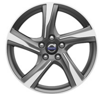
Ixion, 7x17" Diamond Cut/Matt Tech Black