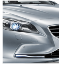
EXPRESS YOURSELF PAGE 18