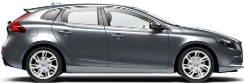
714 Osmium Grey metallic (Also available for R-Design)