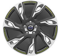
Ailos, 7,5x18" with Lime Décor