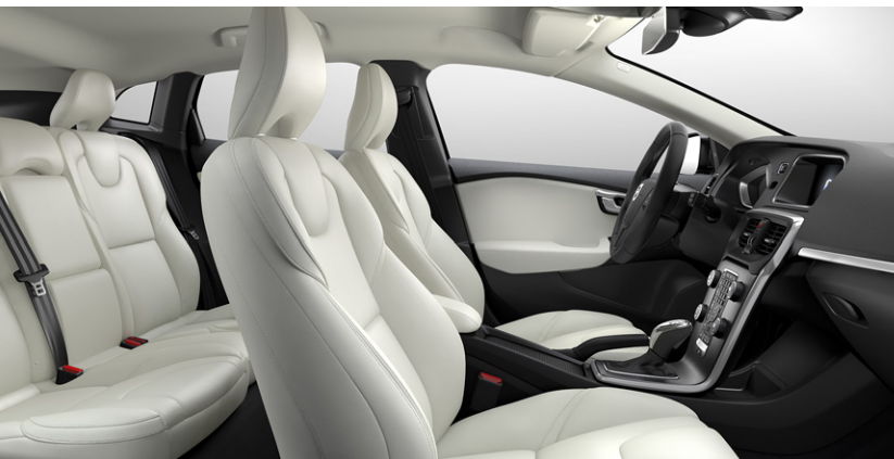
Leather, P10G Charcoal interior with Blond seats and headlining