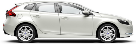
707 Premium Crystal White Pearl (Also available for R-Design)