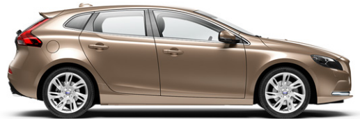
708 Raw Copper metallic