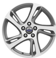
Spider, 7x17" Diamond Cut/Dark Grey