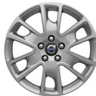
Freja, 7x17" Diamond Cut/Light Grey