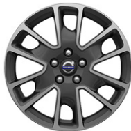
Freja, 7x17" Diamond Cut/Matt Dark Grey