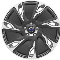
Ailos, 7,5x18" with White Décor