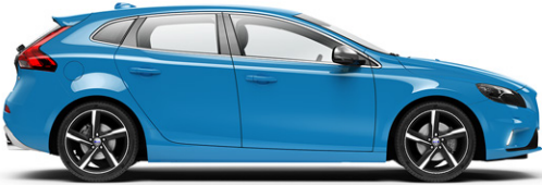
619 Rebel Blue (Only available for R-Design)