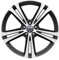
Artio, 8x19" Diamond Cut/Matt Tech Black