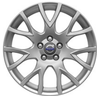
Medusa, 7,5x18" Silver