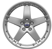
Medea, 7,5x18" Silver