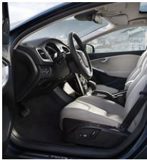
PERSONALISE YOUR INTERIOR PAGE 22