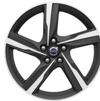
Ixion II, 7,5x18" Diamond Cut/Matt Black