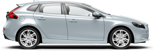
710 Misty Blue metallic