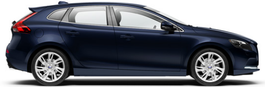
467 Magic Blue metallic