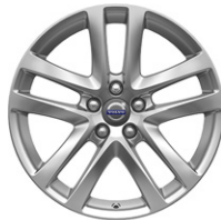
Tamesis, 7,5x18" Silver