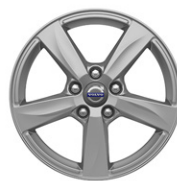
Matres, 7x16" Silver