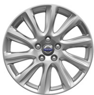
Mannan, 7x17" Silver