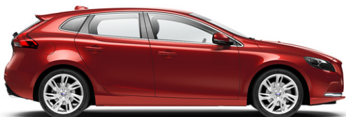
702 Flamenco Red metallic