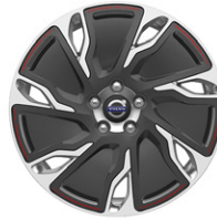
Ailos, 7,5x18" with Red Décor