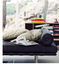
INSIDE YOUR CAR PAGE 08