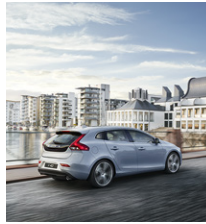
DRIVE-E PAGE 16