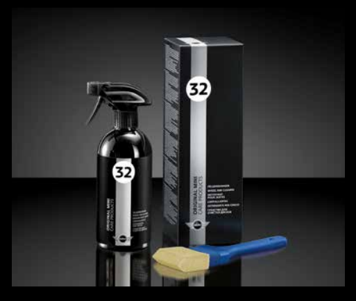
WHEEL RIM CLEANER SET. 500ml with special brush.