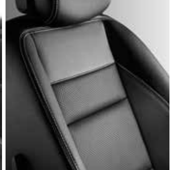
Sports seats, Renaultsport steering wheel, aluminium pedals, analogue dials... make the most of pure excitement. The GT Line Nav comes with two-tone dark charcoal Renaultsport seats as standard, optional dark carbon grey perforated leather upholstery.