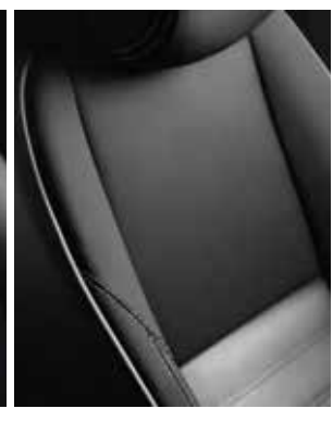
With the steering wheel and gearshift knob in supple leather, chrome inserts, instrument surrounds in glinting chrome and door trims in satin chrome... the Mégane Dynamique Nav revels in its sporty character. It's available with 'Java' cloth in dark charcoal as standard, and with charcoal leather as an option.