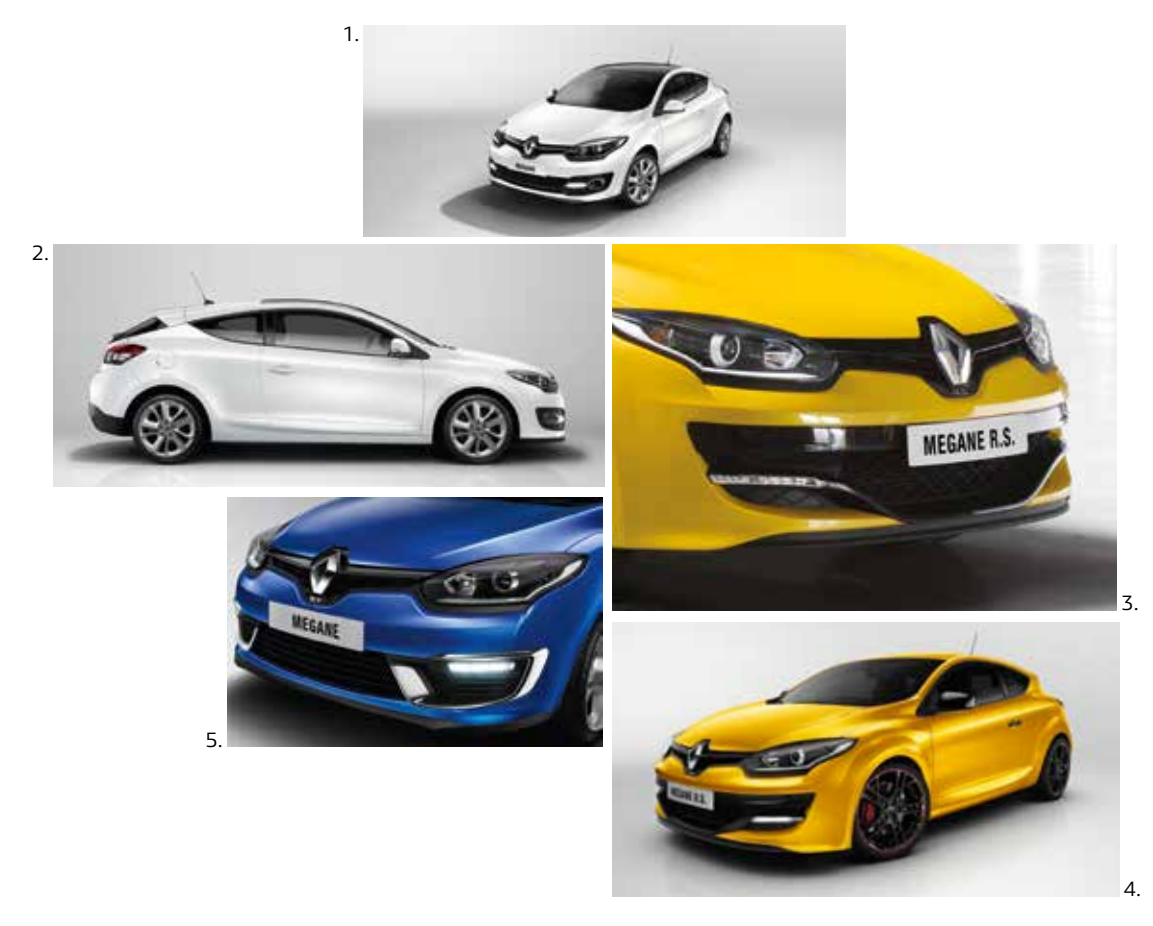
1-2. Coupé version. Elegance takes a step further. With its new design, LED lights and expressive lines, the Mégane Coupé reinvents the very concept of 'sporty chic'. 3-4. Renaultsport version. Directly inspired by motor racing, exuding efficiency and with a thirst for performance, the Mégane Renaultsport is in pole position. 5. GT Line Versions. With a streamlined front end and sporty character, the Mégane sets your heart racing even before you take the wheel. These versions are available on the Mégane Hatch, Coupé and Sport Tourer versions.