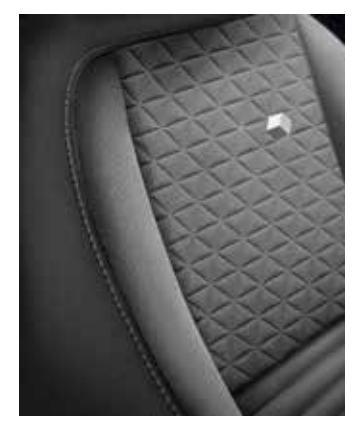
LIMITED cloth upholstery.