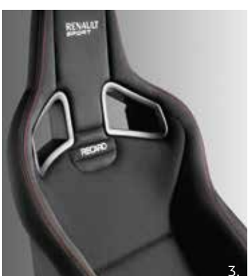
1. Mégane Renaultsport comes with Renaultsport sport seats, analogue dials, aluminium pedals and Renaultsport steering wheel. The image shows Renaultsport Recaro sport seats in carbon grey cloth and synthetic leather with red detailing and stitching (optional). 2. Carbon grey Renaultsport cloth upholstery with red stitching. 3. Renaultsport Recaro sport seats in carbon grey cloth and synthetic leather with red detailing and stitching (optional).