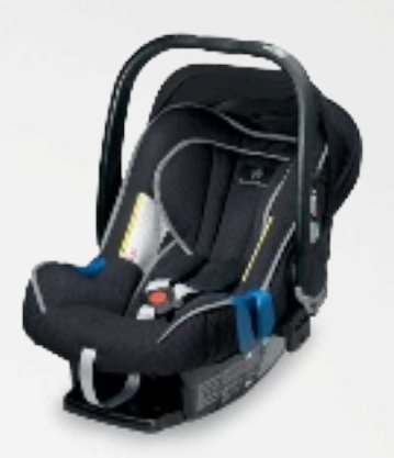
Up to 15 months Up to 13 kg