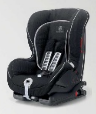
8 months to 4 years 9 to 18 kg