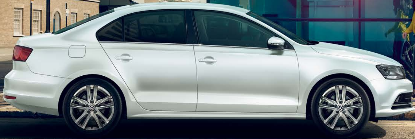
Model shown is Jetta GT with optional Pure White non-metallic paint.