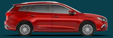
DYNAMIC RED tri-coat paint

Tri-Coat and metallic paint optional at extra cost.