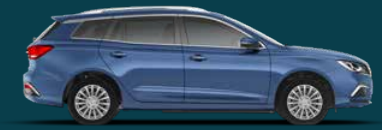
PICCADILLY BLUE metallic paint