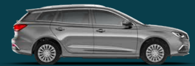
WESTMINSTER SILVER metallic paint