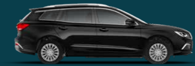
BLACK PEARL metallic paint