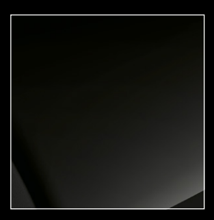
Piano Black interior surface