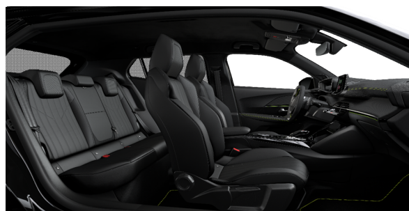
Optional Nappa Leather (GT / GT Premium) - 4HFX