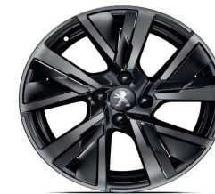
16" 'Taksim' alloy wheels