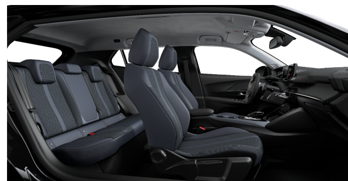
Allure / Allure Premium - A6FX