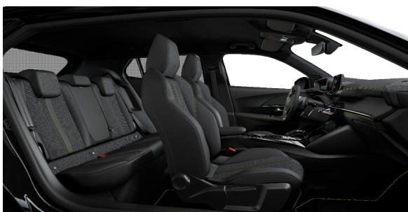
GT - A7FX