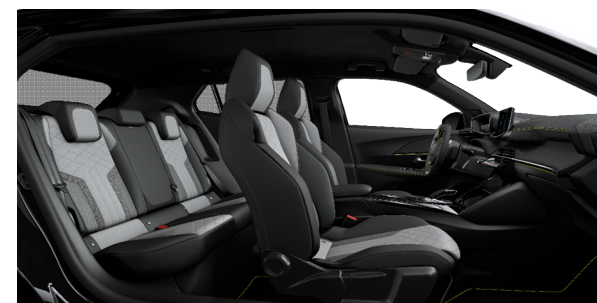
GT Premium - 2AFX