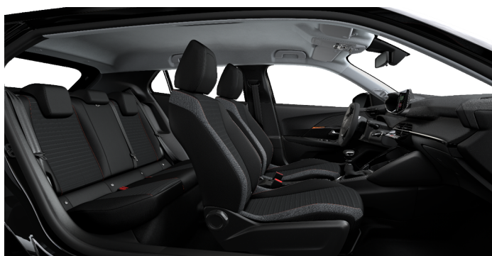
Active Premium - A5FX