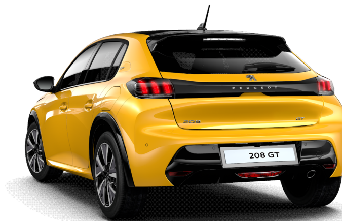
208 GT (available as Petrol, Diesel and EV)