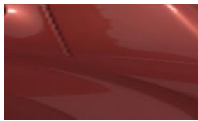
AMBER RED (M)