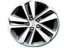
17 inch two-tone 'Phoenix' alloy wheel Option on Professional and Asphalt