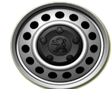
17 inch steel wheel with black centre cap