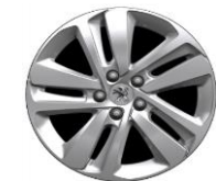
17 inch 'Phoenix' alloy wheel Standard on Asphalt