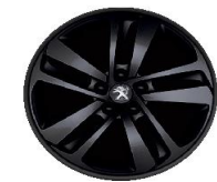
17 inch black Phoenix alloy wheel Available as standard on Sport Edition only