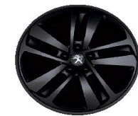
17 inch black Phoenix alloy wheel Available as standard on Sport Edition only