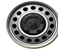
16 inch steel wheel with black centre cap