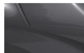
NIMBUS GREY (M)