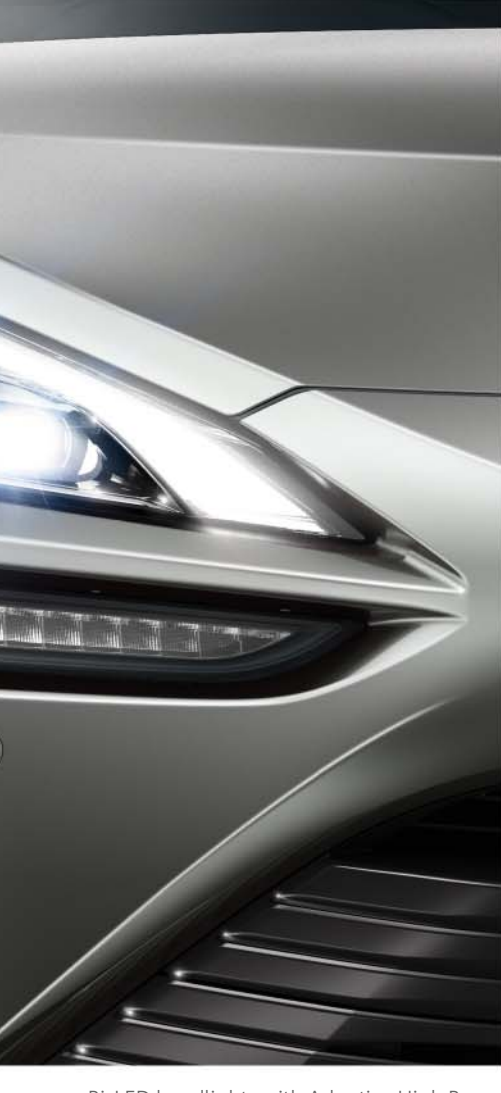
Bi-LED headlights with Adaptive High Beam System enable and disable individual LEDs within each headlamp for precision control.