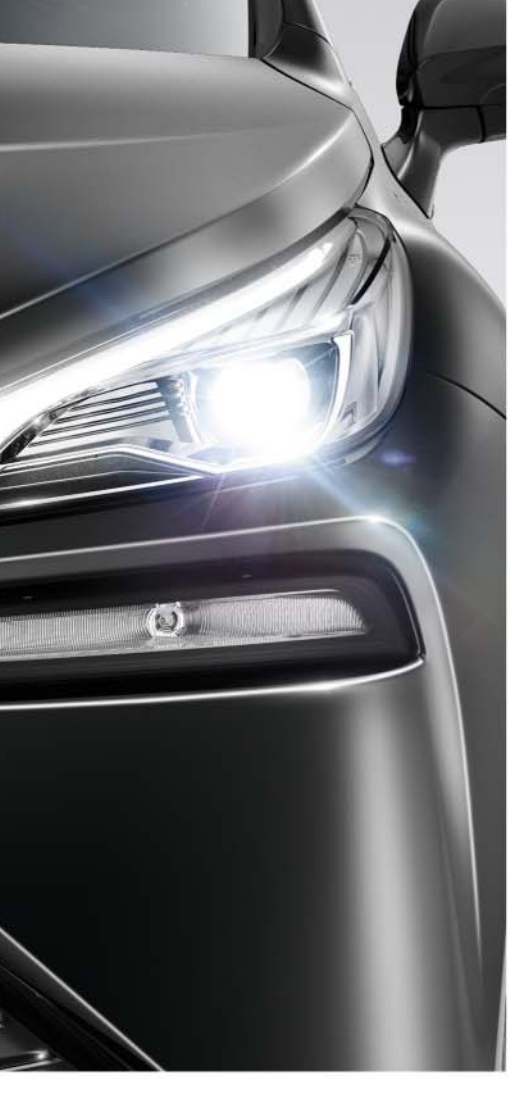
Stylish Bi-LED headlamps including Automatic High Beam light the way safely.