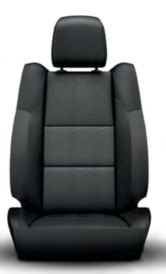
Carolina Mesh/Shift (Standard in Black)