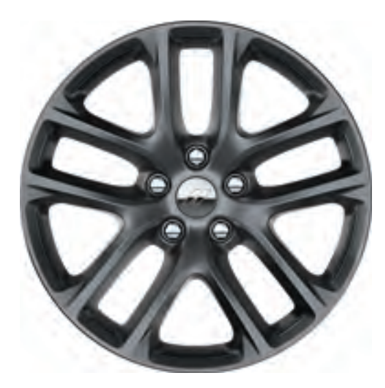
20 by 10-inch Hyper Black // (WHW) Standard