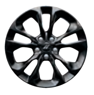
20 by 8-inch Black Noise // (WH4) Available