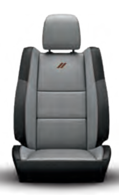
Nappa Leather trim with Nappa Axis II perforated inserts and Ruby Red accent stitching [Available in Black/Vitra Grey]