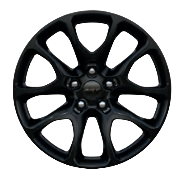
20 by 10-inch Lights Out // (WHE) Available