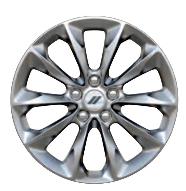
20 by 8-inch Satin Carbon // (WHT) Standard