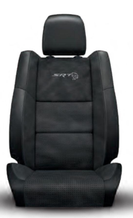
Nappa Leather trim with Suede Axis II perforated inserts and Silver accent stitching (Standard in Black)