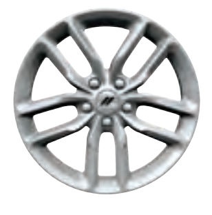
20 by 8-inch Fine Silver // (WHJ) Standard