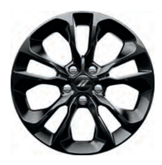
20 by 8-inch Black Noise // (WH4) Available