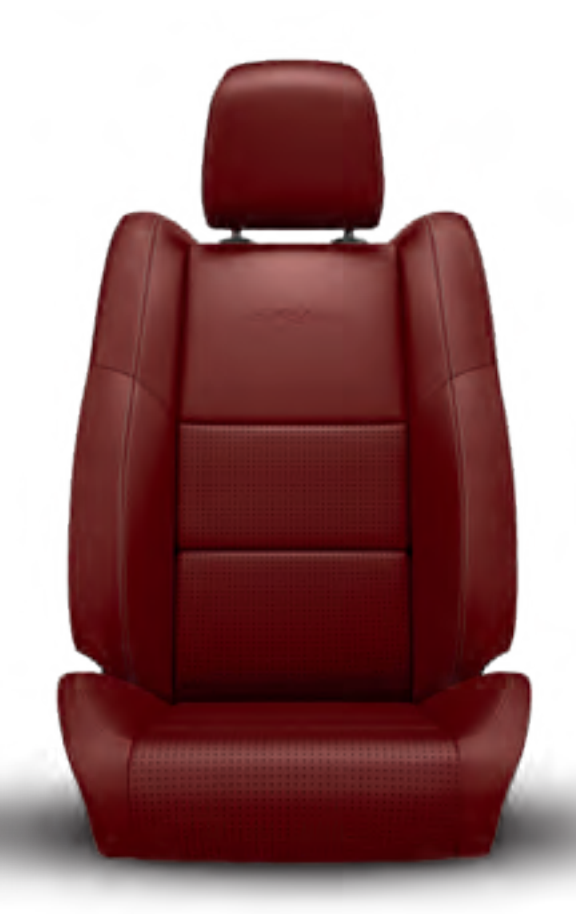
Laguna Leather trim with Laguna Axis II perforated inserts and Silver accent stitching (Available in Black/Demonic Red)