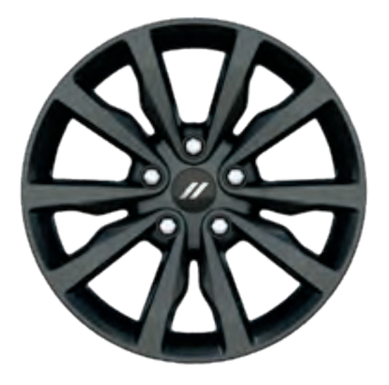
18 by 8-inch Black Noise // (WBA) Available