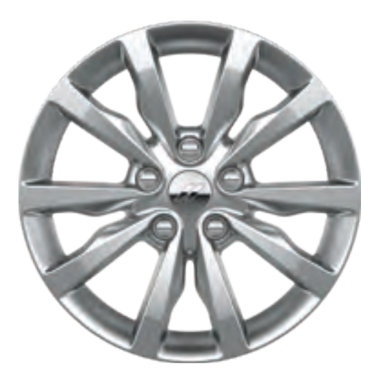
18 by 8-inch Technical Silver // (WP1) Standard