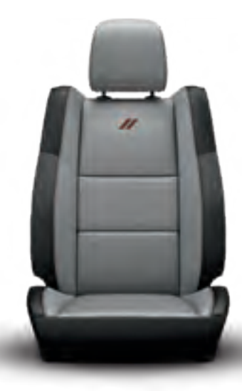
Nappa Leather trim with Nappa Axis II perforated inserts and Ruby Red accent stitching [Available in Black/Vitra Grey]