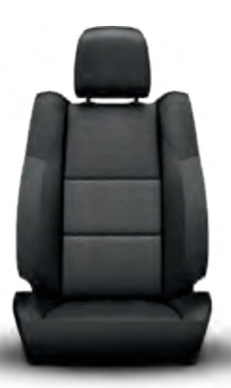
Carolina Mesh/Shift (Standard in Black)