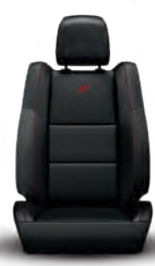
Nappa Leather trim with Nappa Axis II perforated inserts and Ruby Red accent stitching (Available in Black)