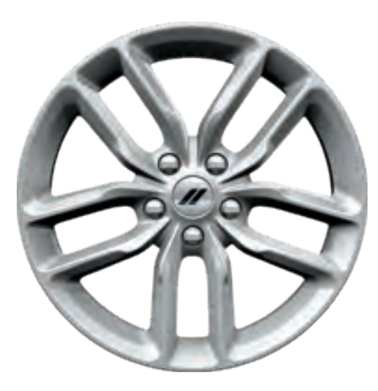
20 by 8-inch Fine Silver // (WHJ) Standard