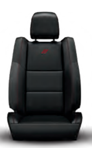
Nappa Leather trim with Nappa Axis II perforated inserts and Ruby Red accent stitching (Standard in Black)