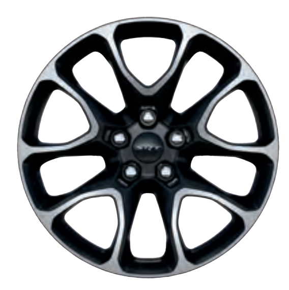
20 by 10-inch Machine Face with Dark pockets // (WHG) Standard