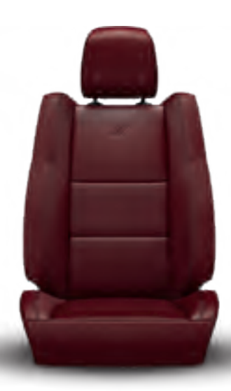
Nappa Leather trim with Nappa Axis II perforated inserts and Ruby Red accent stitching (Available in Black/Ebony Red)