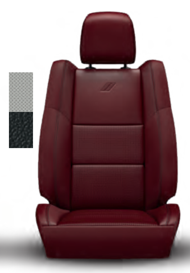
Nappa Leather trim with Nappa Axis II perforated inserts (Available in Black, Black/ Ebony Red, Black/Vitra Grey)