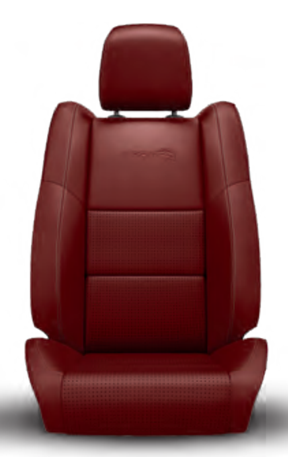
Laguna Leather trim with Laguna Axis II perforated inserts, Silver accent stitching and SRT embossed logo (Available in Black/Demonic Red)