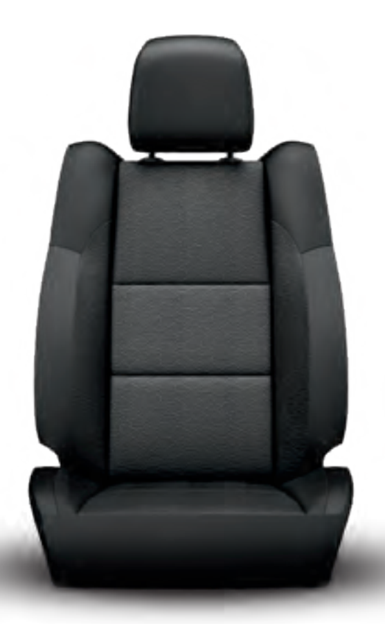
Carolina Mesh/Shift (Standard in Black)