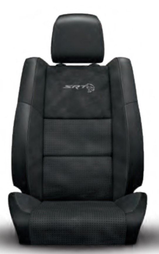
Nappa Leather trim with Suede Axis II perforated inserts, Silver accent stitching and SRT® embroidered logo (Standard in Black)