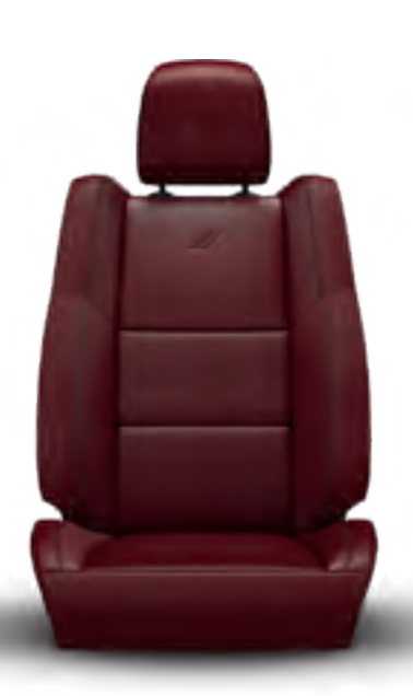
Nappa Leather trim with Nappa Axis II perforated inserts and Ruby Red accent stitching (Available in Black/Ebony Red)