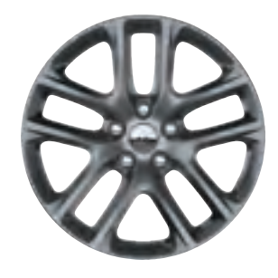
20 by 10-inch Hyper Black // (WHW) Available