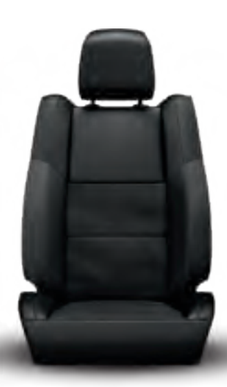
Nappa Leather trim with Suede Axis II perforated inserts and Ruby Red accent stitching [Available in Black]