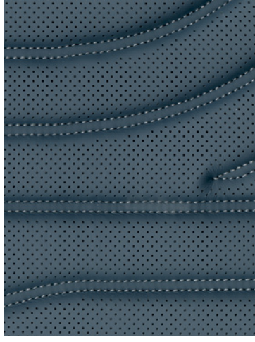
Blue Gray Nappa Leather<sup>18</sup> PLATINUM+