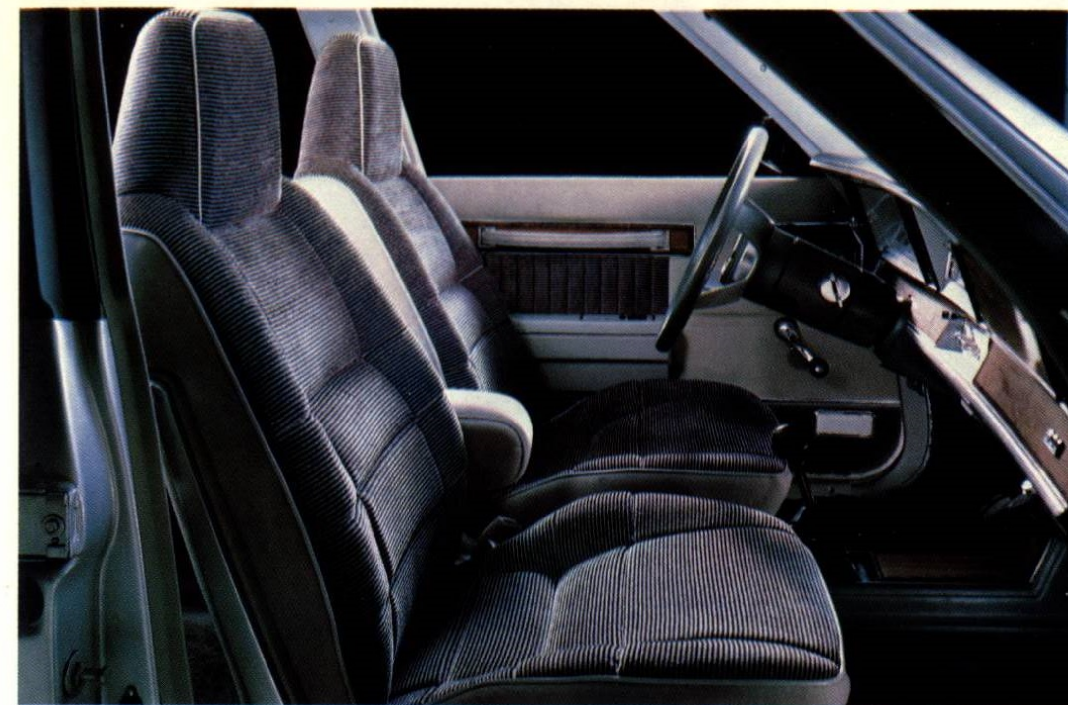
Cloth high-back bucket seats with reclining seat backs—standard all models.

Add to this the luxury interior environment, the spaciousness and more-than-generous rear seat legroom afforded by the 2616 mm (103 inch) wheelbase, the innovative Electronic Voice Alert system that provides subdued verbal warning should any one of ten different non-normal conditions exist (low fuel, door ajar, engine overheating, are some examples) and you have the special character that is Dodge 600 ES, all at a realistically affordable cost. It's a car that deserves to be test driven. It's a whole new breed of car from Chrysler.