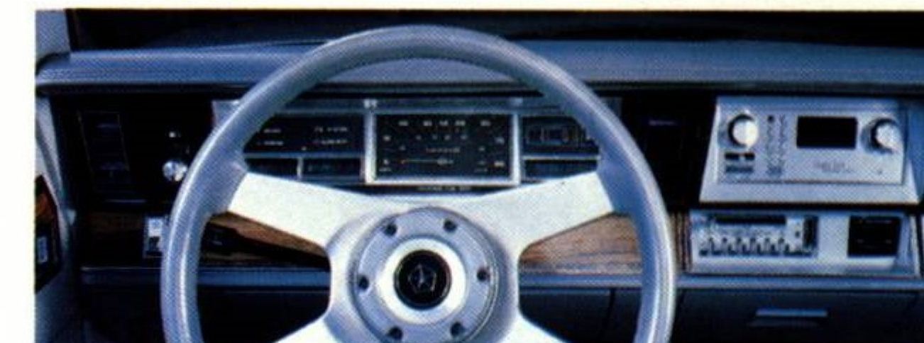
Dodge 600 instrumentation.

Room, Comfort and Quiet are its Hallmarks. Step inside a new 600 ES and experience its impressively sporty 5-passenger seating with generous headroom, legroom and hiproom dimensions all around. Its quality-engineered Unibody Construction makes every ride ultra-smooth and quiet. And while you drive, enjoy the plush comfort of ES's sport steering wheel, floor-mounted centre console, and cloth high-back bucket seats with free-standing centre armrest (available in red, silver, blue or brown).