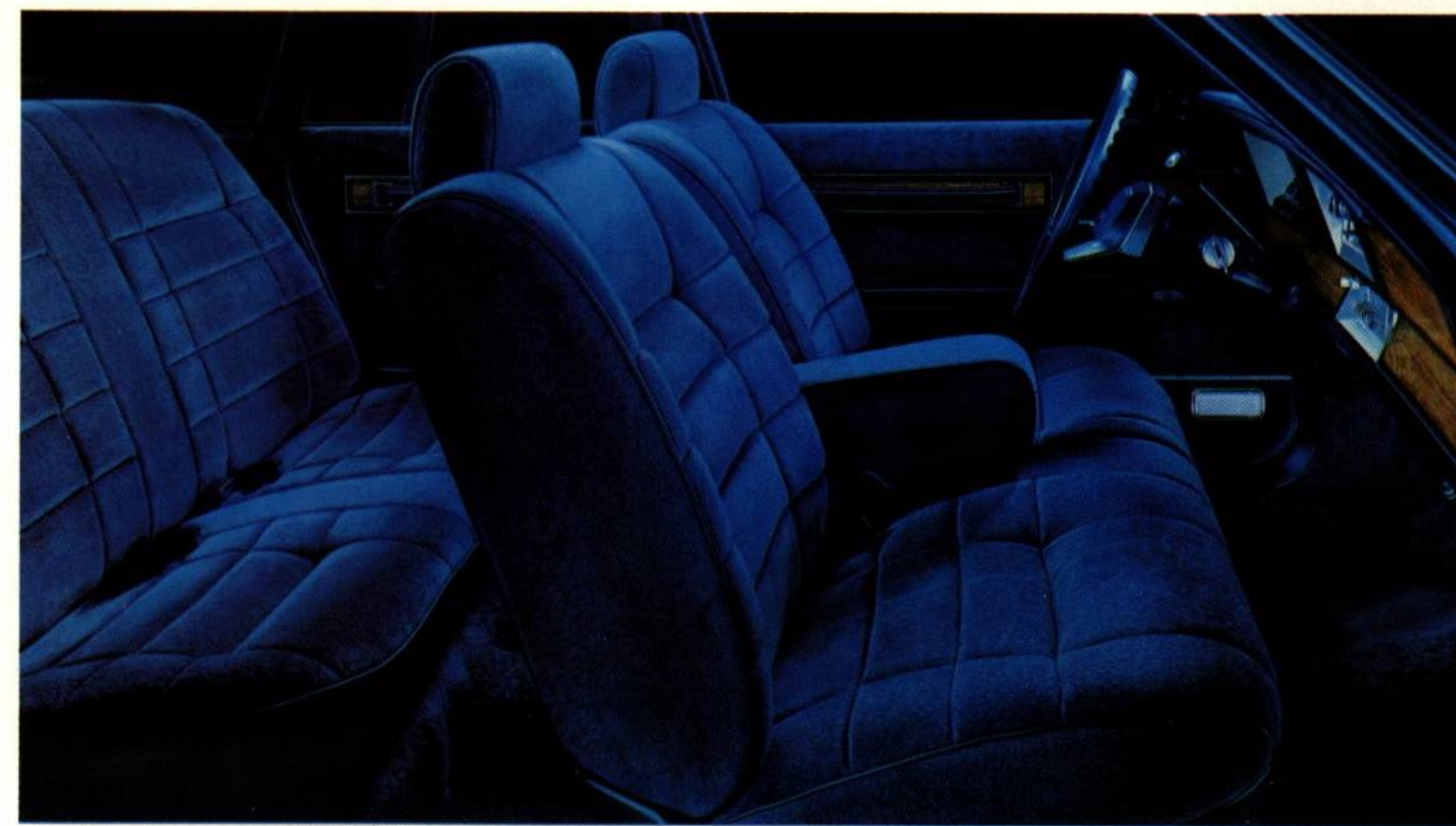
Cloth bench seat with folding centre armrest—optional Dodge 600.

Luxury Like No Other At Its Price. Like its "ES" counterpart, the Dodge 600 offers as standard seating high-back cloth buckets in red, silver, blue or brown. But that's only the beginning... a front bench seat with folding centre armrest is available in cloth or vinyl at no extra charge, on cars with optional automatic transmission for those who desire the utility of six-passenger seating. In addition to its versatile seating choices, a Dodge 600 is luxuriously trimmed and appointed with soft, cut-pile carpeting and other interior accents colour-keyed to the upholstery. Add to this a classically-contemporary soft-top instrument panel with Visual Message Centre, and you have a car that's uncommonly luxurious in an up-to-date fashion.