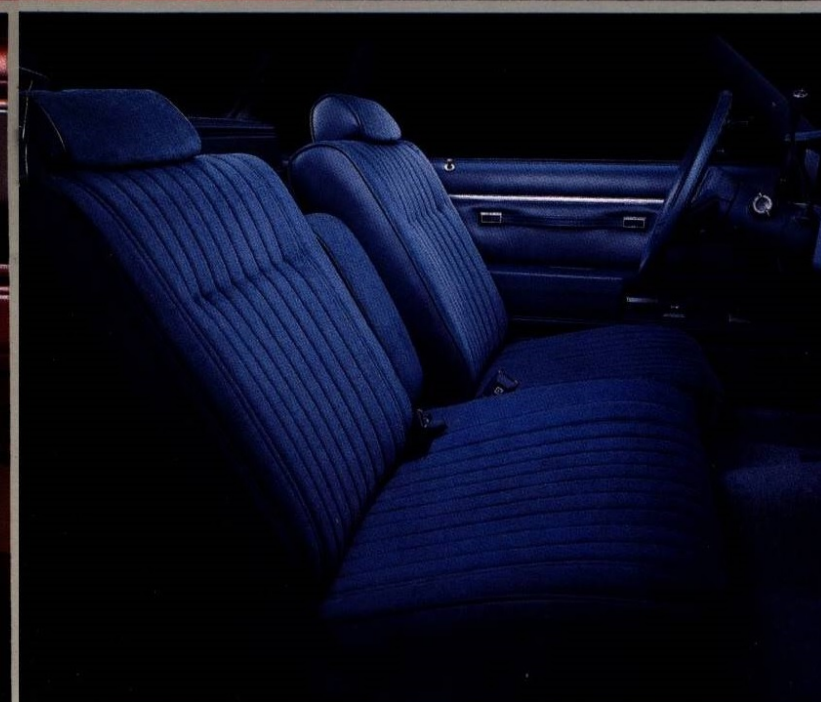
Optional 55/45 split bench in Blue cloth.