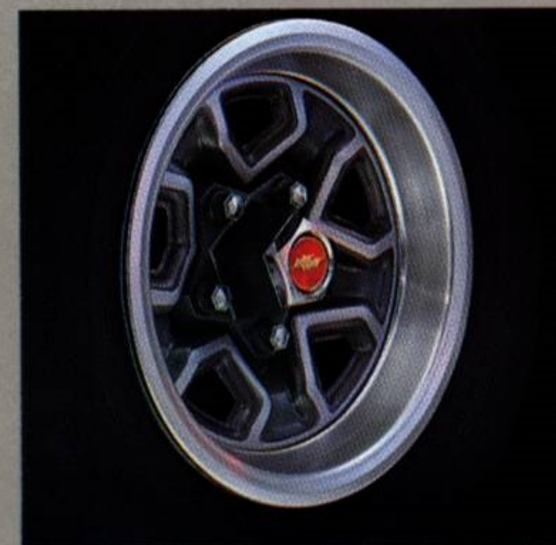
Rally Wheels (Std. with SS Sport Decor).