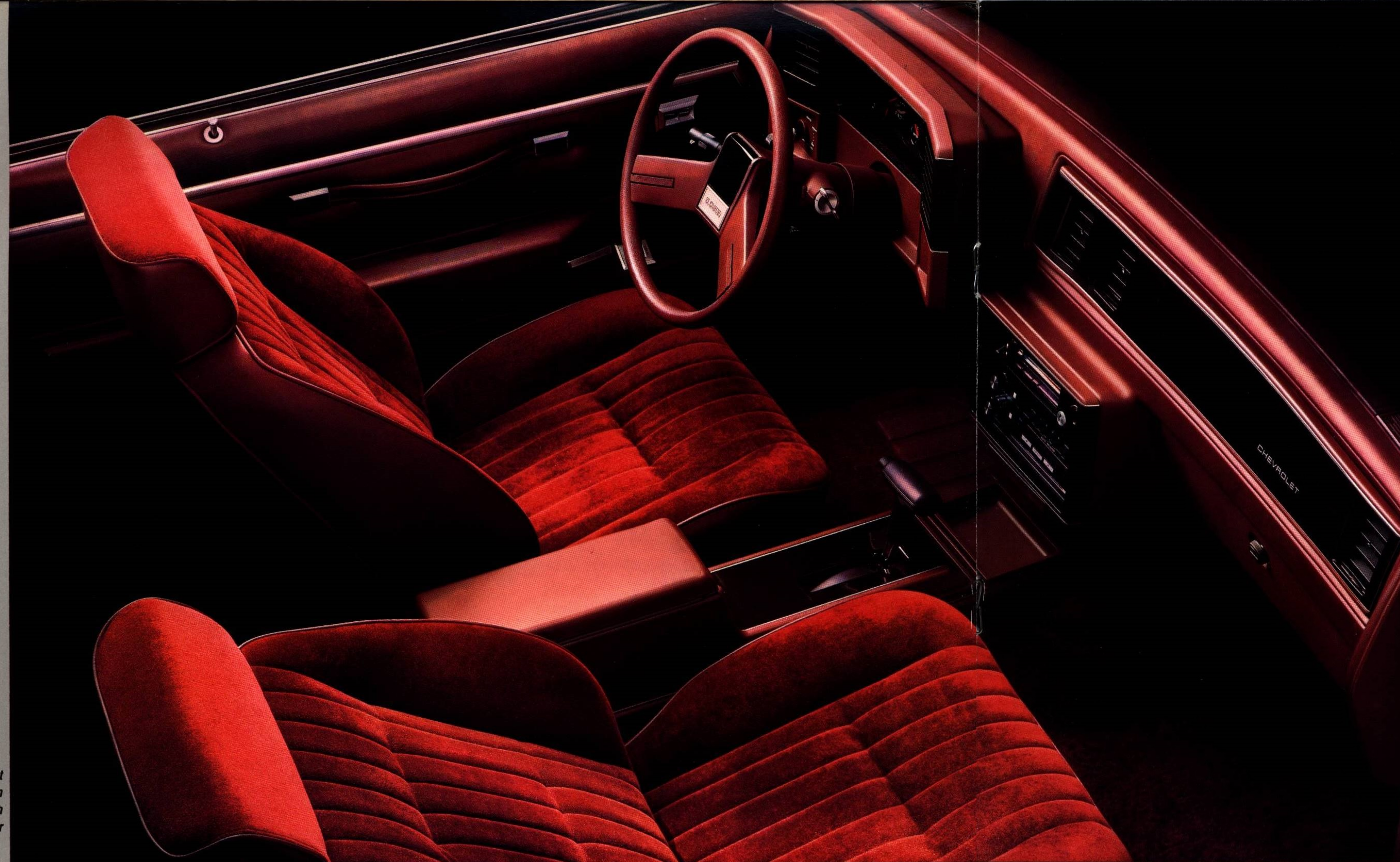
Optional reclining front buckets in Maroon cloth, shown with optional center console.