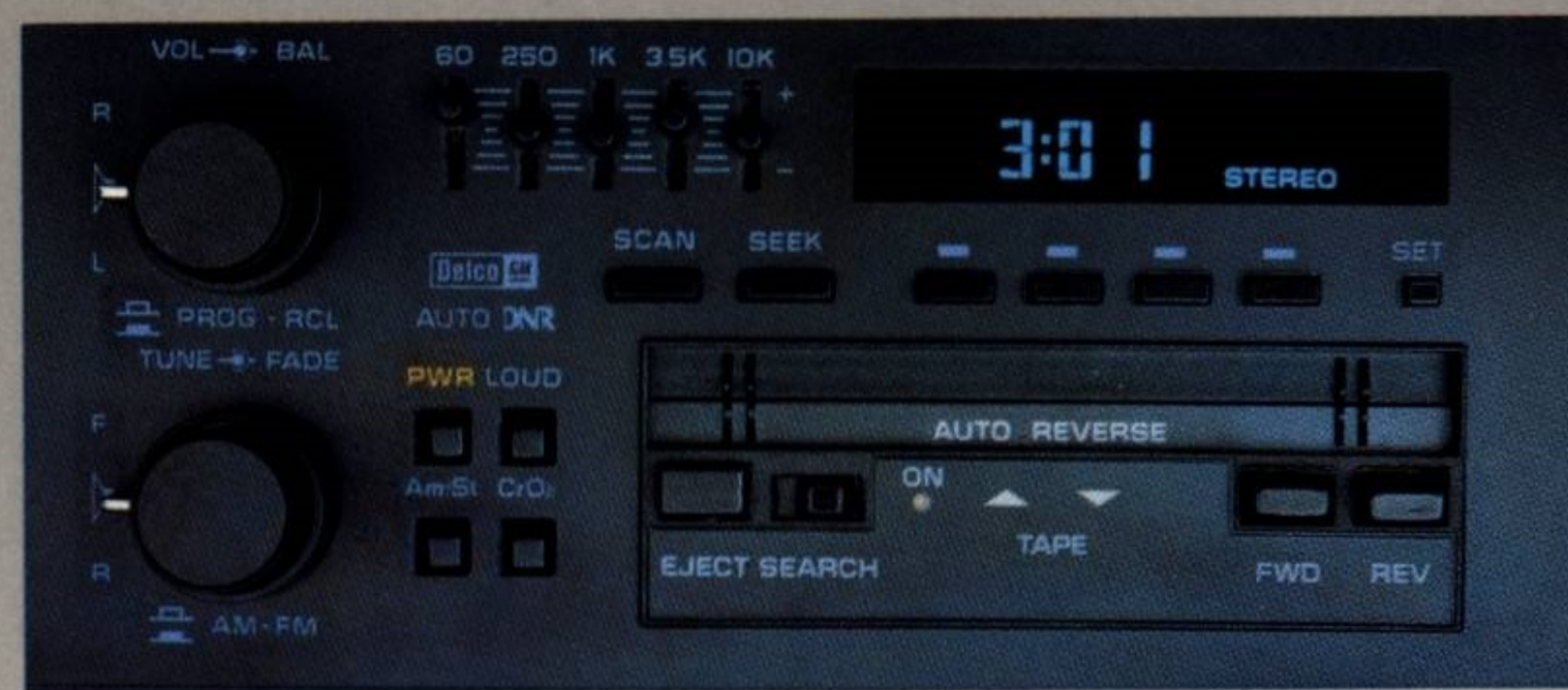
Delco AM stereo*/FM stereo ETR™ radio with cassette, Seek and Scan, Search and Repeat, graphic equalizer and clock.

A wide variety of features and options allow you to really personalize your El Camino. Study the lists and charts to assist you in your choices. All items pictured are optional at extra cost.