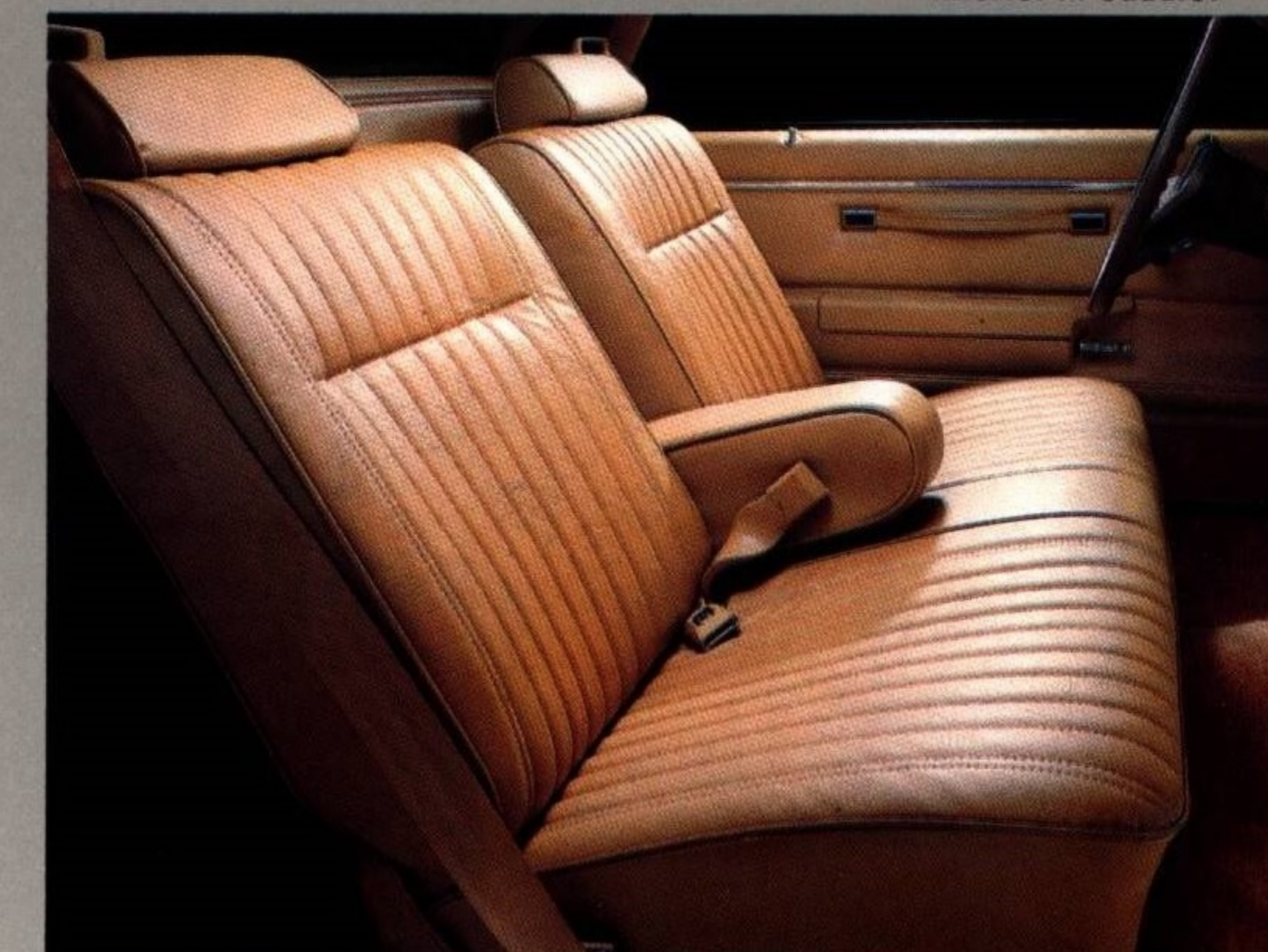
Standard El Camino interior in Saddle.