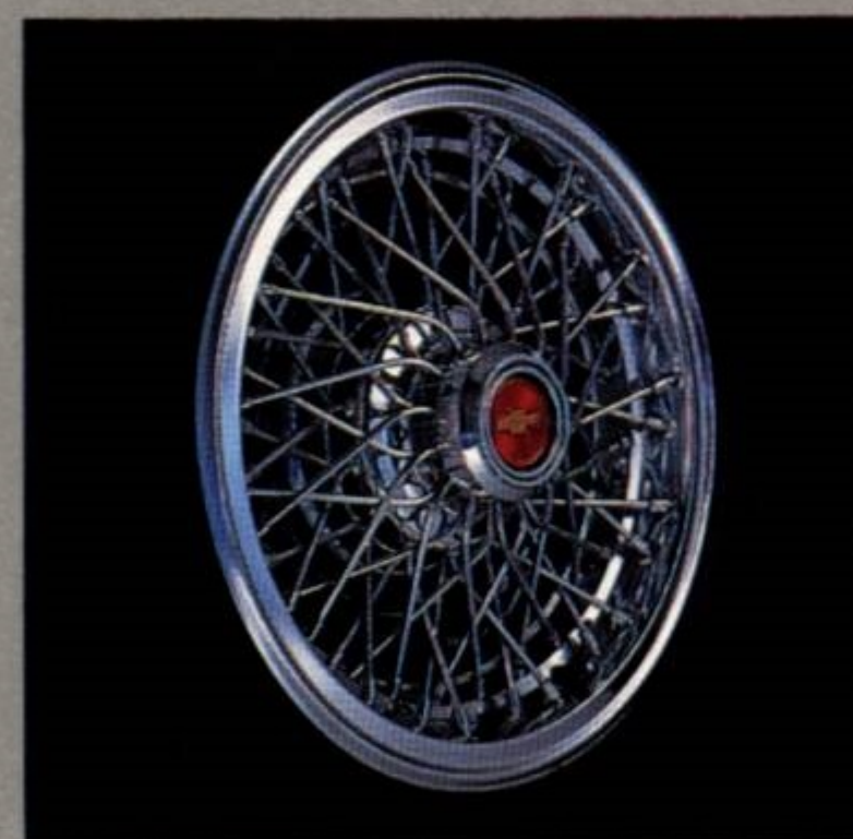
Wire wheel covers with locks.