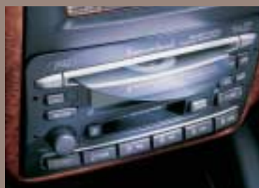
If a Fairmont Ghia is sounding good, here's why: a 250 watt 6-stack in-dash CD/radio/cassette system is standard.