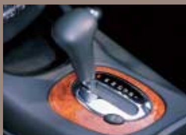
Electronic 4-speed automatic with power and economy modes.