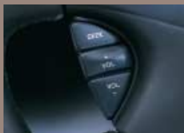
Steering wheel mounted controls for audio volume, station and CD track.