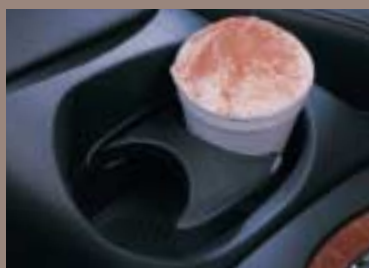
Ergonomically efficient right hand side details like convenient cup holders.