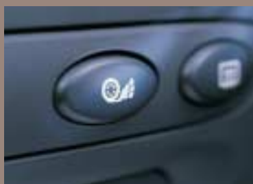
On slippery roads, Traction Control improves handling during acceleration and cornering. If desired, the system can be switched off.*