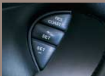
Cruise control helps maintain a constant speed on the open road. Disengages when brakes are applied.