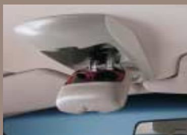
Go straight to your sunglasses when you need them, thanks to this handy holder in the overhead console.*