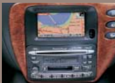
Satellite Navigation System. Voice guidance leads you to your destination. Optional on sedans.*