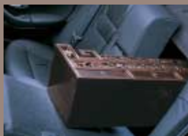
Long or awkward items aren't a problem thanks to Fairmont's 60/40 split fold rear seat back.