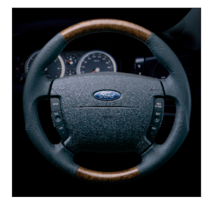
> Woodgrain Steering Wheel. A true driver's steering wheel. Designed to match your Fairlane or LTD's instrument panel, this steering wheel combines leather and woodgrain for a luxurious feel. Available in Rhui Maple or Stone Maple.