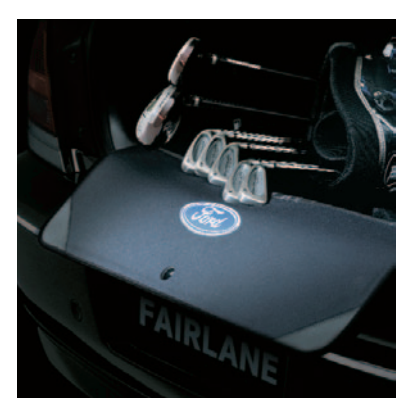
> Boot Scuff Guard. Uniquely designed to help protect the rear bumper and boot lip from damage when loading and unloading. Securely attaches to the boot floor and can be installed in seconds. Folds neatly away when not in use.