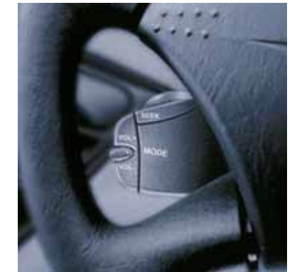
> Steering column mounted audio controls are standard on Focus.

> Focus CL has all the space, comfort and style for whatever the week and the weekend have in store for you. Standard features include Control Blade Independent Rear Suspension, power steering, dual-stage driver's airbag and a single-slot CD player with steering column mounted controls. Fog lamps, 60/40 split rear seat, driver and passenger vanity mirrors and remote central locking are also standard. The safety features include a centre rear lap-sash seatbelt, anti-submarining front seat pans and front seatbelt pretensioners. An optional safety package includes a front passenger airbag and ABS. All this in a choice of either a 1.8 litre 5-speed manual or optional 2.0 litre 4-speed auto, in 5-door hatch or 4-door sedan. Plus it has the rally bred handling to make other drivers green with envy.