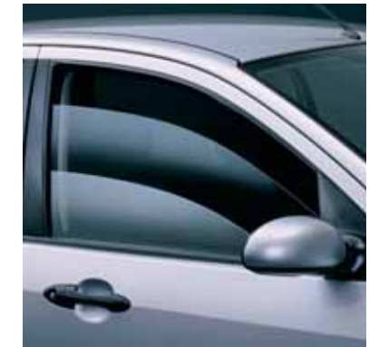
> Power front windows feature one-shot lowering on the driver's side.

> Focus LX has all the style with extra comfort and safety. The comfort isn't just from the body hugging seats or the refined interior, it's also in the peace of mind you have with the impressive list of standard safety features on the LX. These include ABS, dual-stage driver and front passenger airbags and a centre rear head restraint. Other standard features include 15" alloy wheels, remote central locking, power front windows, Titanium-effect interior finishes, power exterior mirrors, air-conditioning and a CD player with steering column-mounted audio controls. You have a choice of either a 1.8 litre 5-speed manual or optional 2.0 litre 4-speed automatic. It comes in 5-door hatch and 4-door sedan with a stylish interior featuring your choice of two fabrics, Midnight Black or Light Stone. If you're after a car with a great combination of style, safety features and performance, you're after a Focus LX.