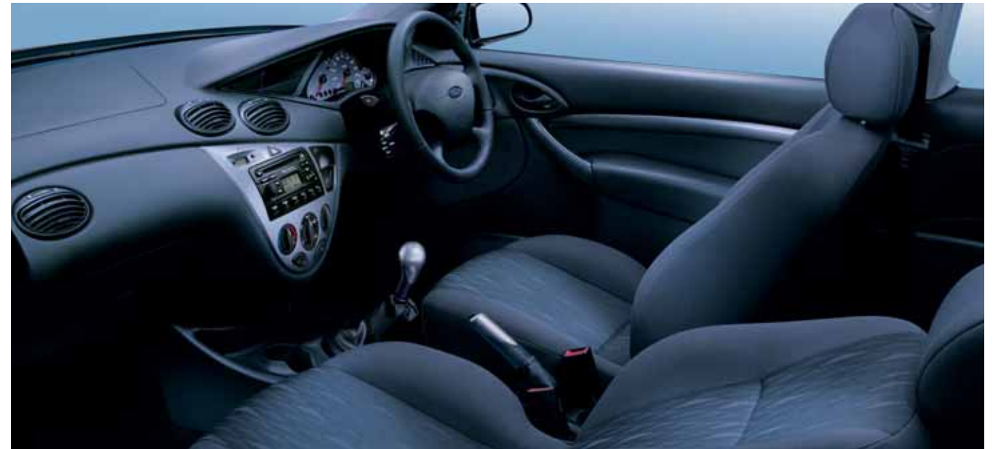
> The enjoyment starts as soon as you get behind the wheel of the sporty Focus Zetec. Leather and brushed aluminium gear knob and hand brake cover available as options.

> Get ready for an exhilarating drive with the Focus Zetec 3-door or 5-door hatch, complete with 2.0 litre 96 kW engine, ABS, 16" alloy wheels and sports suspension with tuned springs and shock absorbers for corner hugging handling. The excitement and enjoyment starts the minute you get behind the wheel. Sink into the sports-style seats, grip the leather-wrapped steering wheel and admire some of the other standard features like the CD player, Dark Argent instrumentation and silver finish interior highlights. Feel the instant response when you touch the accelerator. Performance, yes, but not at the expense of all of the creature comforts you would expect with Focus. If that isn't enough for you, then the list of optional extras for the Zetec like 17" alloy wheels, VDC AdvanceTrac* and a sports body kit, will really get your heart racing.