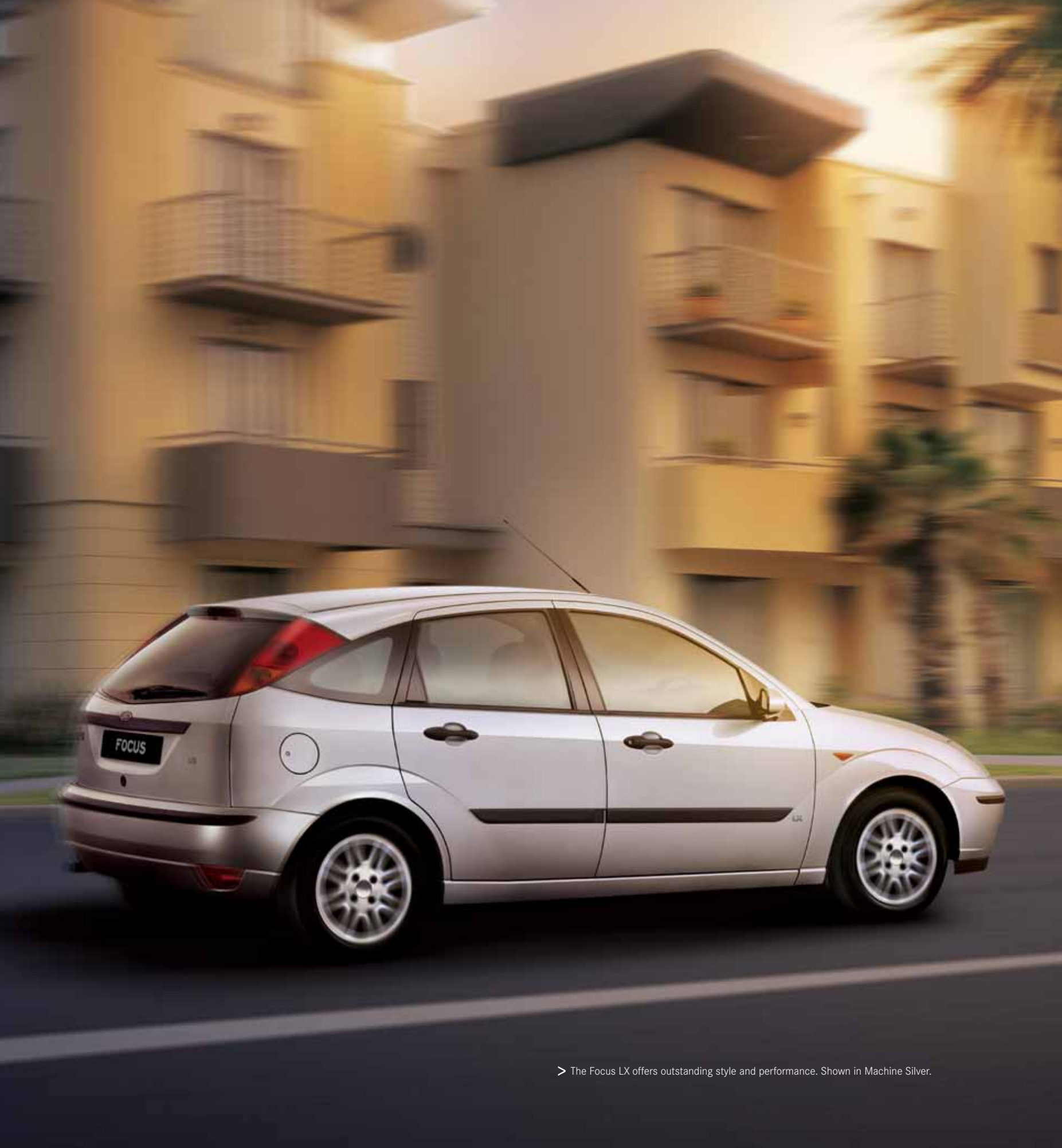
> The Focus LX offers outstanding style and performance. Shown in Machine Silver.