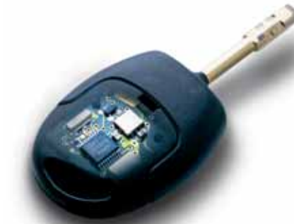
> The Focus is equipped with a state-of-the-art electronic Passive Anti-Theft System and a high security engine immobiliser operated via a miniature transponder within the keyfob.