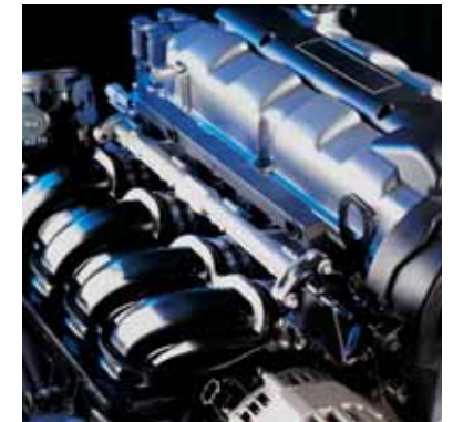
> The ultra-responsive 2.0 litre Duratec ST170 engine pumps out 127 kW of power.

> One word describes the performance of the Ford Focus. Spirited. From the ultra responsive handling to the lively spring you get when you put your foot down. We engineered it that way. Ford designers, engineers and drivers have pushed this car to the limit and beyond. Victories in the World Rally Championships testify to the strengths of the entire Focus range. With Focus, Ford achieved a world first by being the first manufacturer to win the major Car of the Year awards in Europe and North America in consecutive years* - a unique double. The 1.8 and 2.0 litre 16-valve engines are highly advanced with relatively flat torque curves. Put simply, the power starts the second you put your foot on the accelerator.