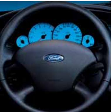
> Full of bright ideas. Everything about the Focus is designed to be better, smarter, safer and more stylish than the rest (Focus ST170 instrument cluster shown).

> You don't need to be powering down the road to get your heart racing in a Focus ST170, all you need to do is sit in the driver's seat. All of the cars in the Focus range reflect our success on the rally fields of the world, but one comes even closer than the rest. It's the Focus ST170. The 2.0 litre 16V Duratec engine delivers 127 kW of power at 7000 rpm and 196 Nm of torque from 5500 rpm through a short-throw, Getrag six-speed manual transmission. With every twist and turn of the road, the highly refined chassis, 17" alloy wheels and dynamically tuned sports suspension deliver enhanced roadholding and a superb ride. Precise, low-friction steering will get your heart thumping. Standard features include Control Blade Independent Rear Suspension, ABS with electronic brake-force distribution, VDC AdvanceTrac (Vehicle Dynamic Control) and a 6-disc in-dash CD player. The combination of performance and style will give you a rush that's way beyond words.