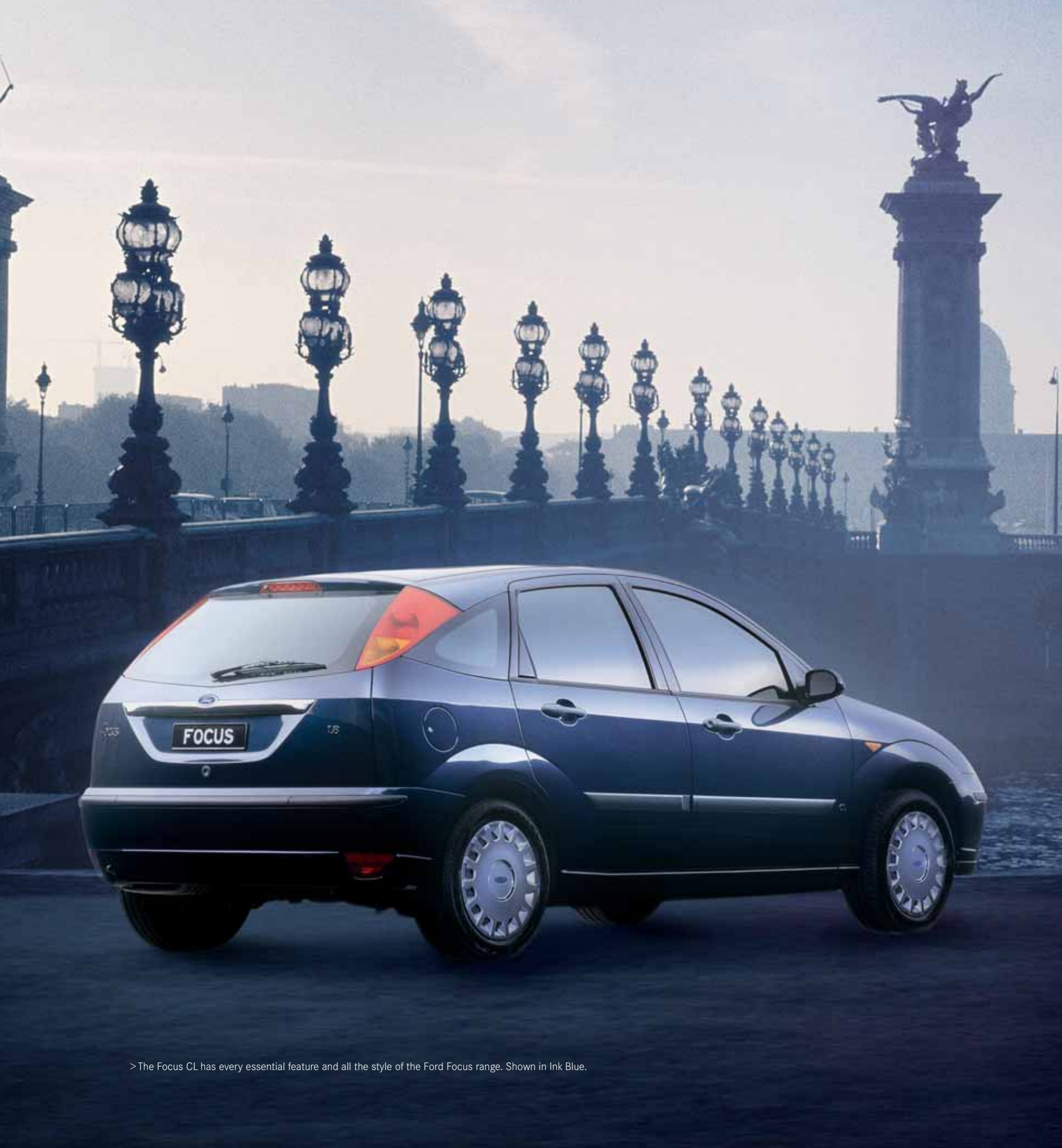
> The Focus CL has every essential feature and all the style of the Ford Focus range. Shown in Ink Blue.