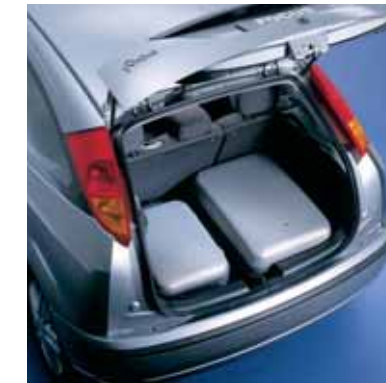
> Focus offers loads of luggage space.