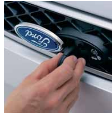
> A key-operated bonnet release system helps deter unauthorised entry to the engine compartment.