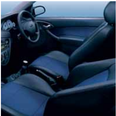
> The Focus ST170 features sports style front seats with Midnight Black leather bolsters for superior support. The unique instrument cluster features electro-luminescent dials.