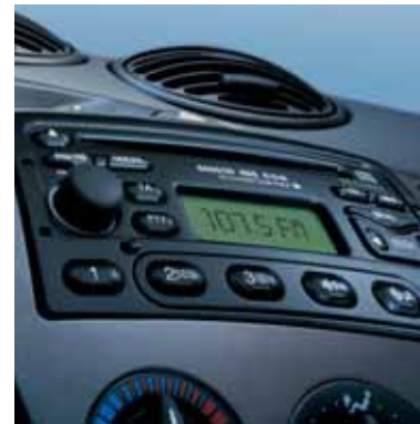
> Every Focus features a CD player as standard.