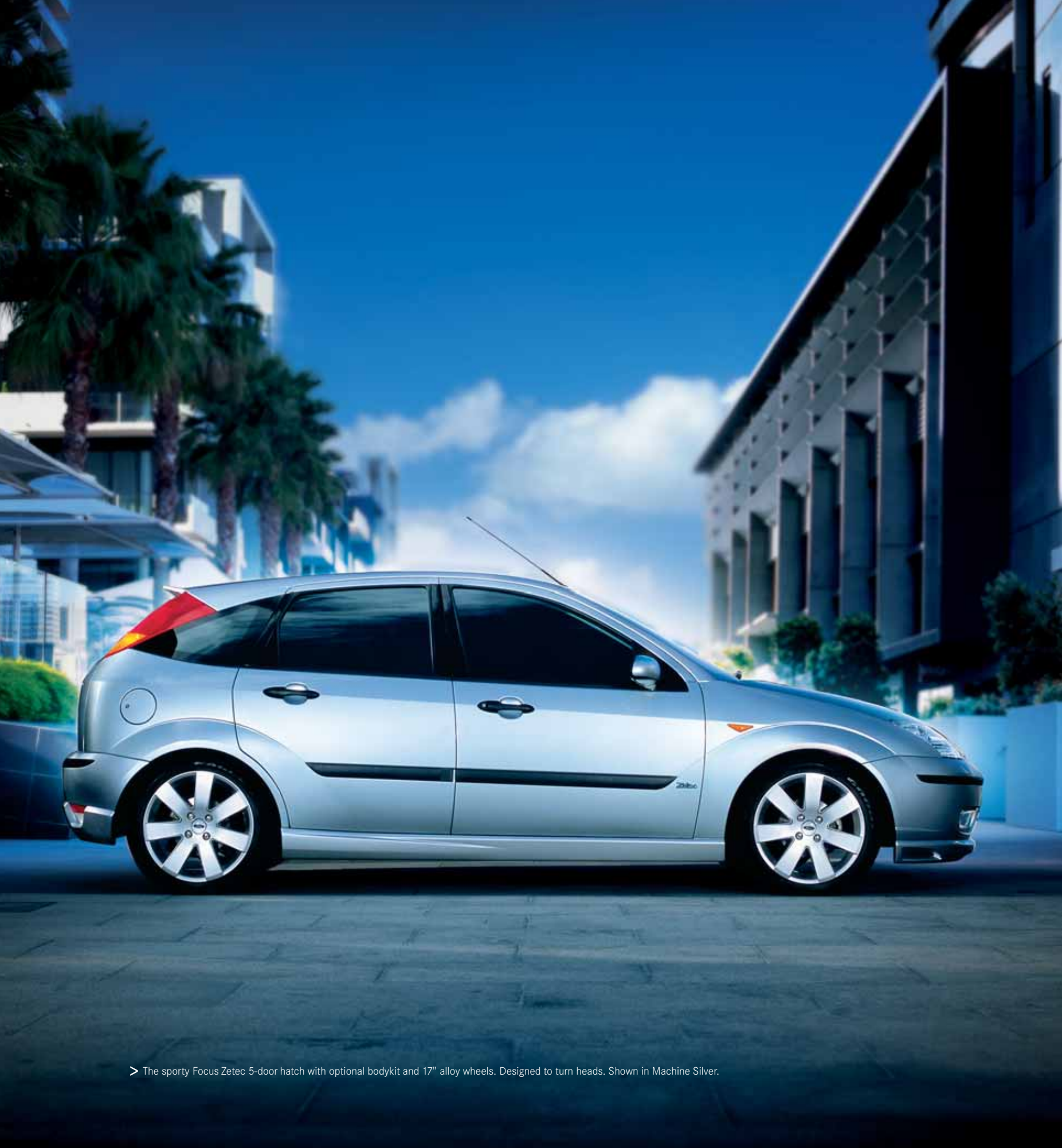
> The sporty Focus Zetec 5-door hatch with optional bodykit and 17" alloy wheels. Designed to turn heads. Shown in Machine Silver.