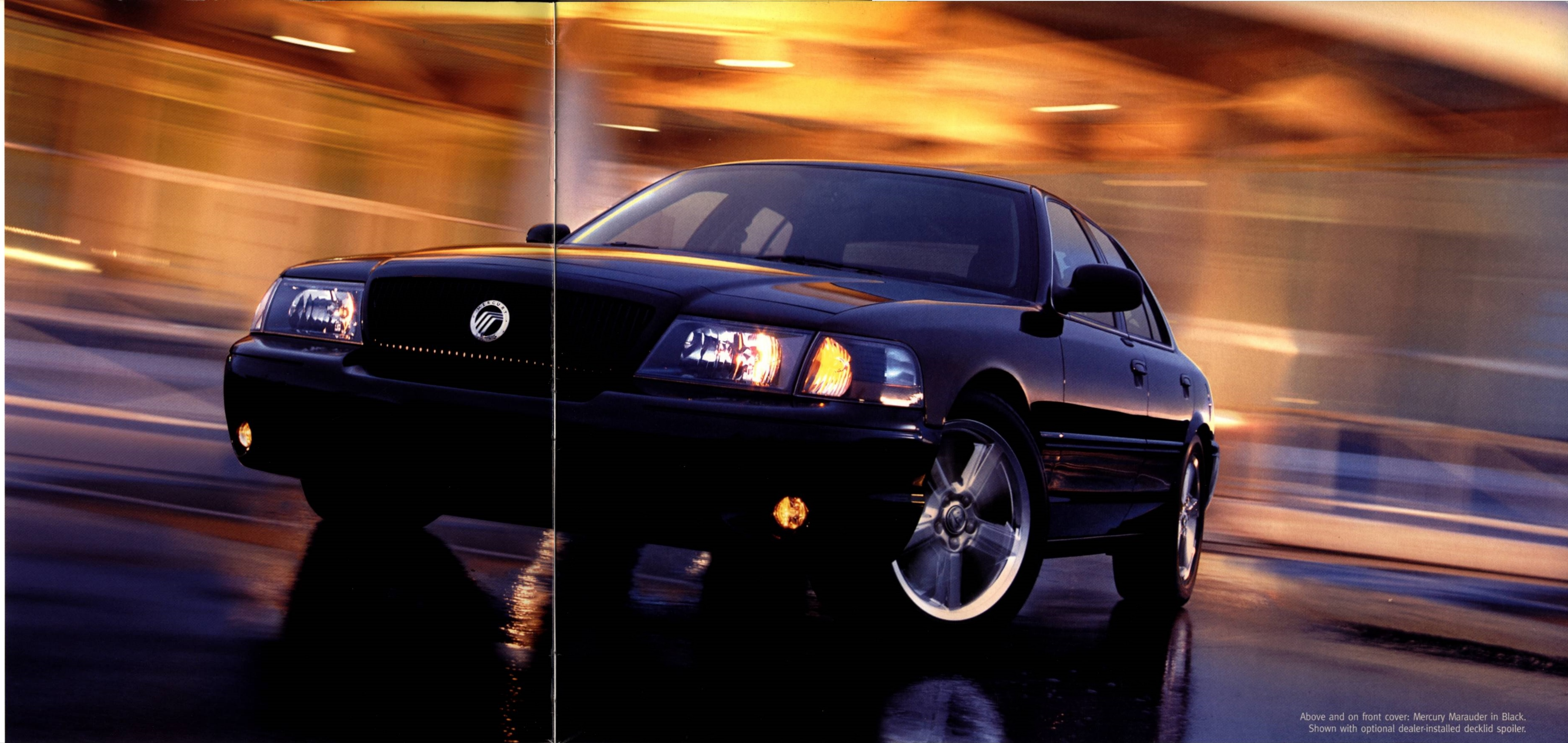
Above and on front cover: Mercury Marauder in Black. Shown with optional dealer-installed decklid spoiler.

As loaded in muscle as it is in attitude, the 2004 Marauder is the authentic American street machine. In classic black, with engine revving and lights glaring, it projects as menacing a stance as you'll ever see on four 18" alloy wheels. Hot Rod magazine calls it "... a message only to those in the know." After hearing the dual exhaust growl, you understand. Immediately. If you're prepared to make a bold statement, align yourself with the winged god. You'll find him throughout Mercury Marauder.