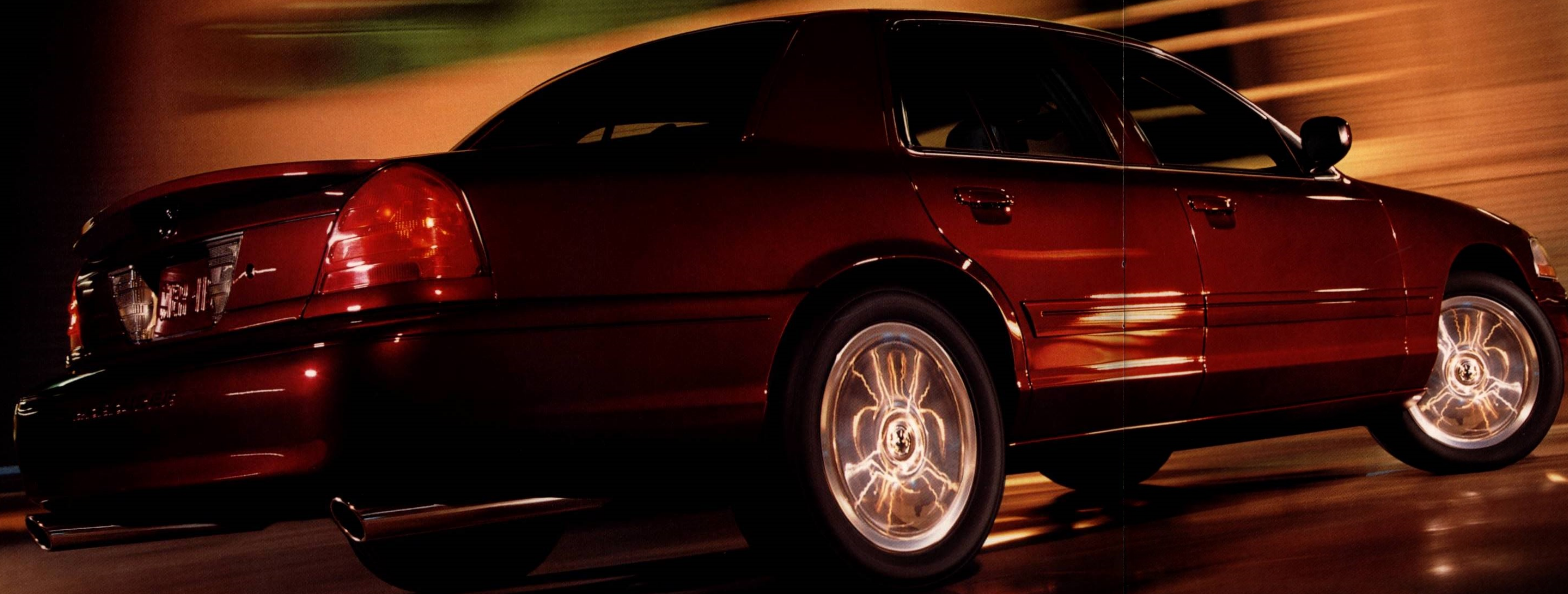
Mercury Marauder in Dark Toreador Red Metallic, a new color for 2004. Shown with optional dealer-installed decklid spoiler.