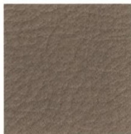
Light Flint leather trim

Mercury uses clearcoat paint for beauty and protection. Colors are representative only. Please see your Lincoln Mercury Dealer for actual paint/trim options.