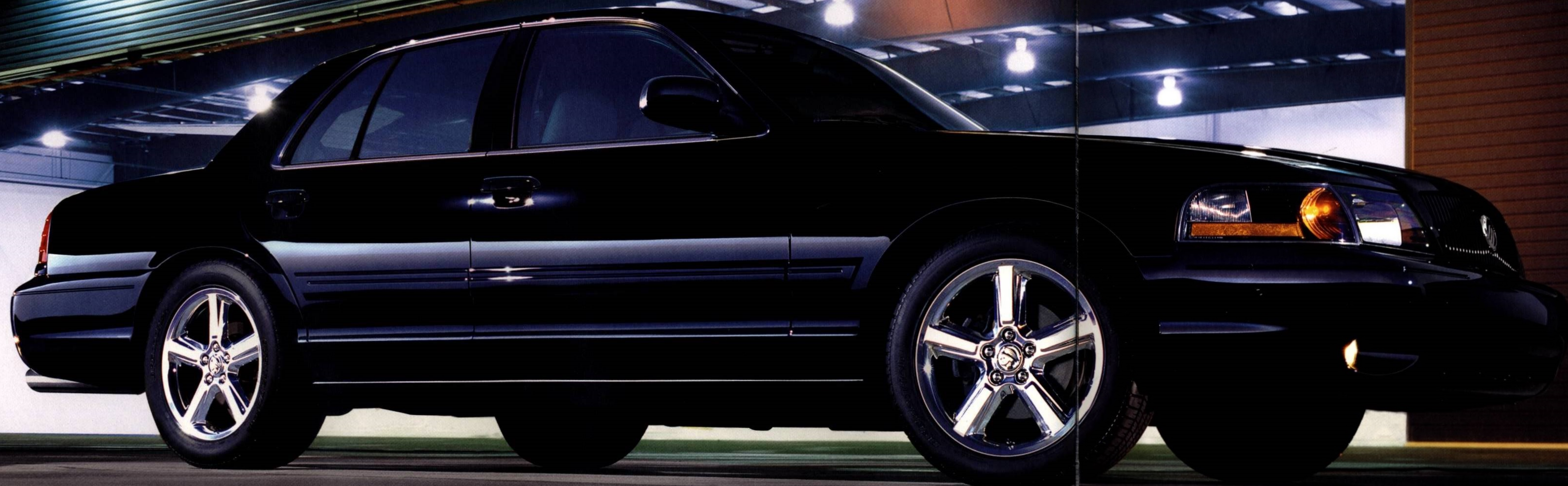
Mercury Marauder in Black.