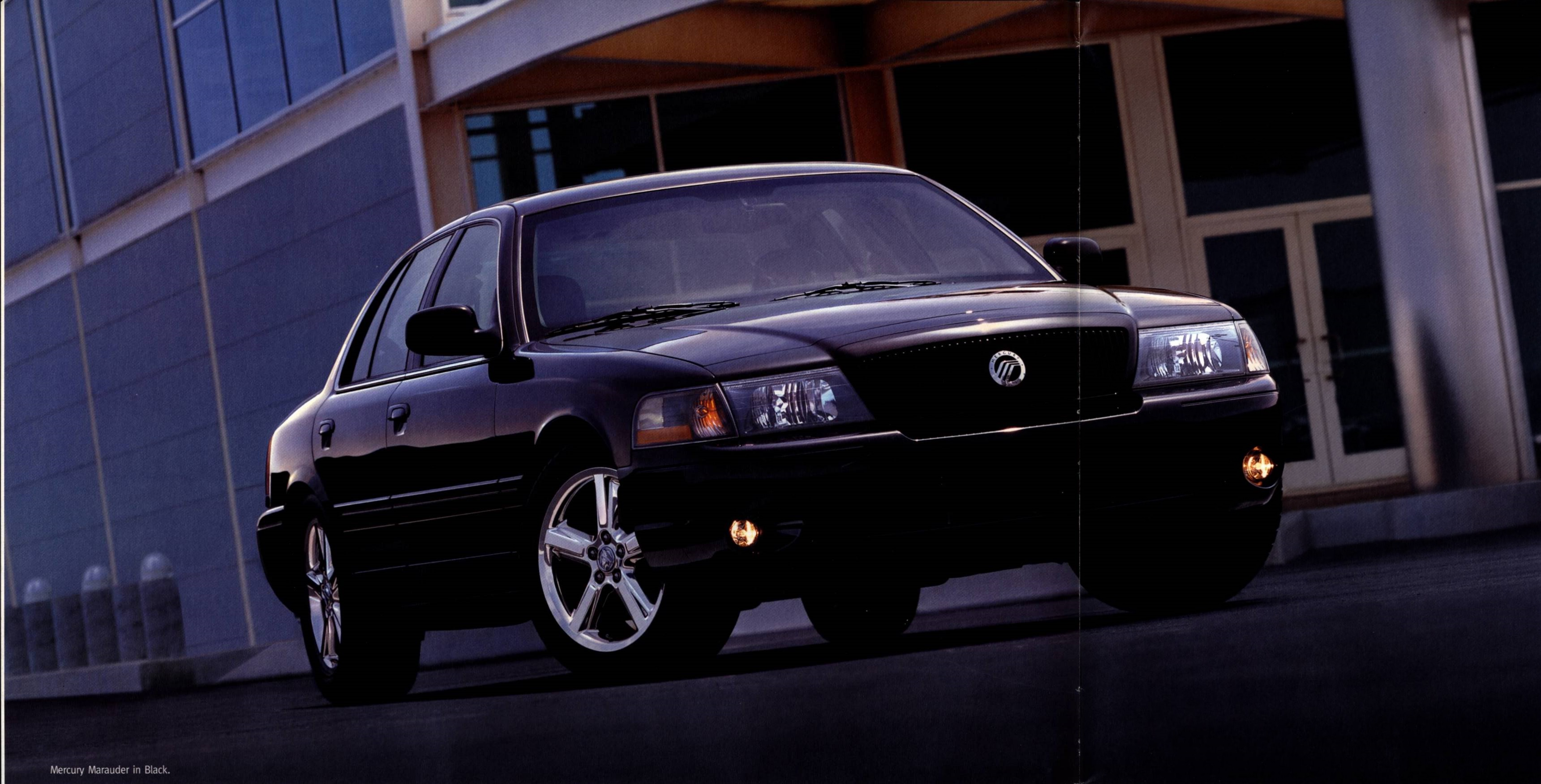
Mercury Marauder in Black.