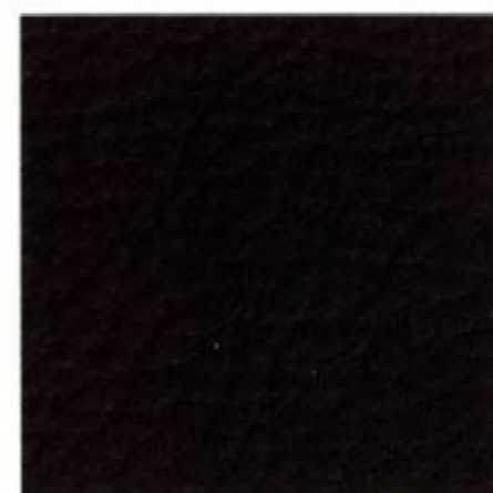
Dark Charcoal leather trim