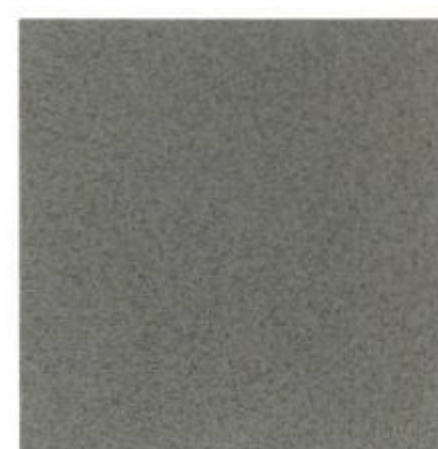
Silver Birch Metallic