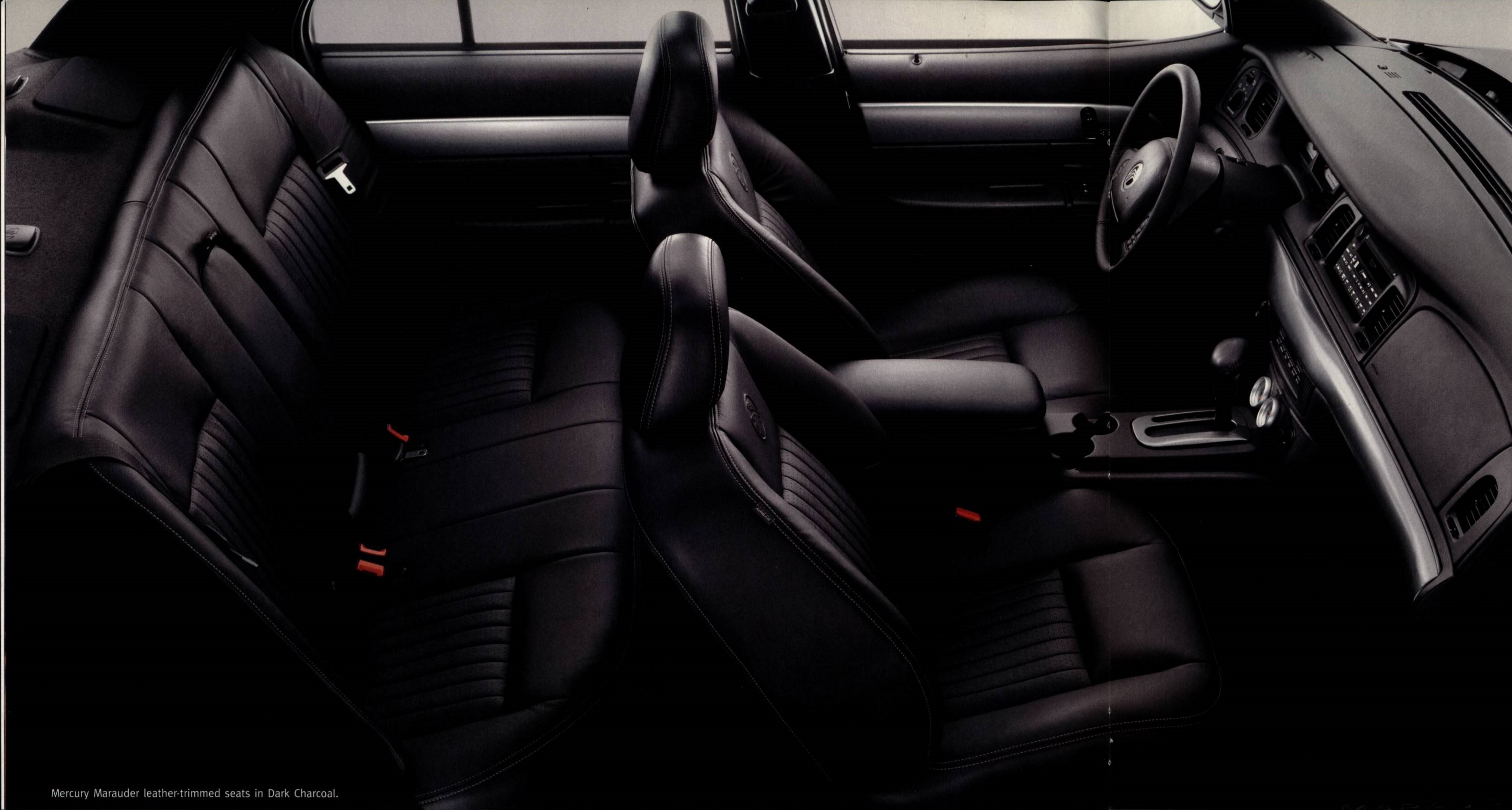
Mercury Marauder leather-trimmed seats in Dark Charcoal.