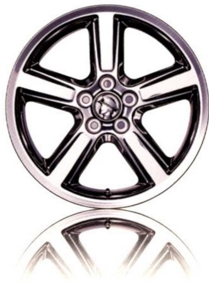
18" 5-Spoke Polished Forged Alloy Wheel Standard