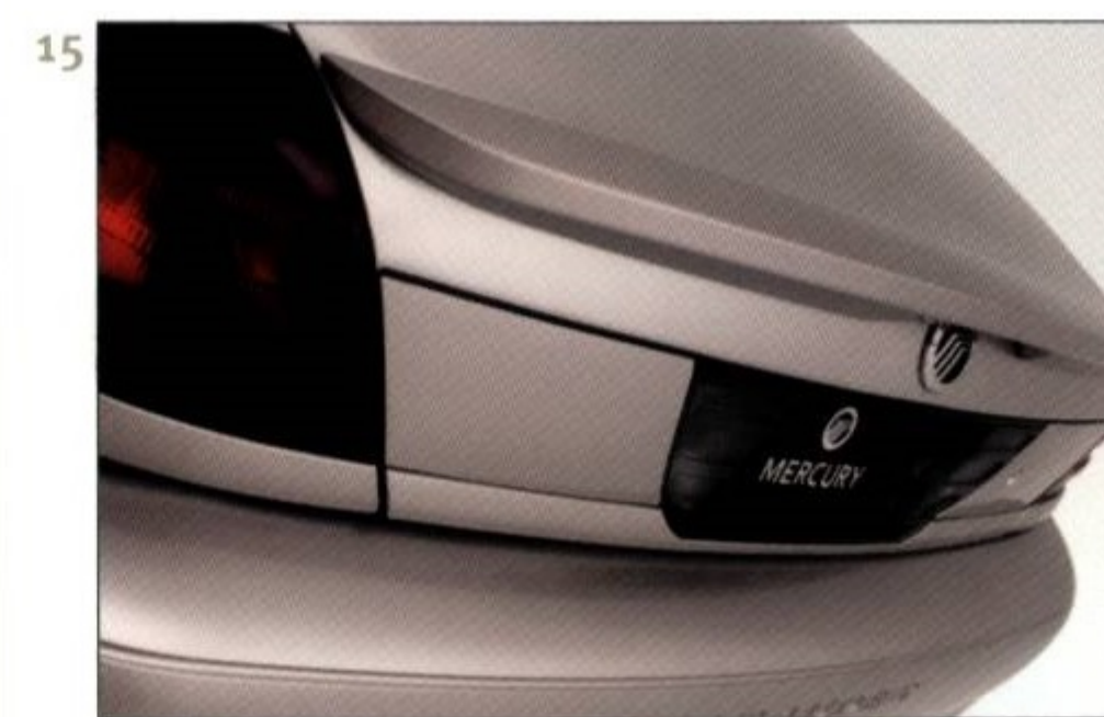
15 Rear Decklid Spoiler Made from tough ABS plastic and manufactured to precise original equipment specifications.