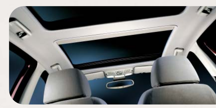
Add the unique SkyDome sunroof and you get five square metres of light to help you enjoy the new Croma's innovative interior.