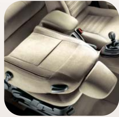
Fold-down front passenger seat.