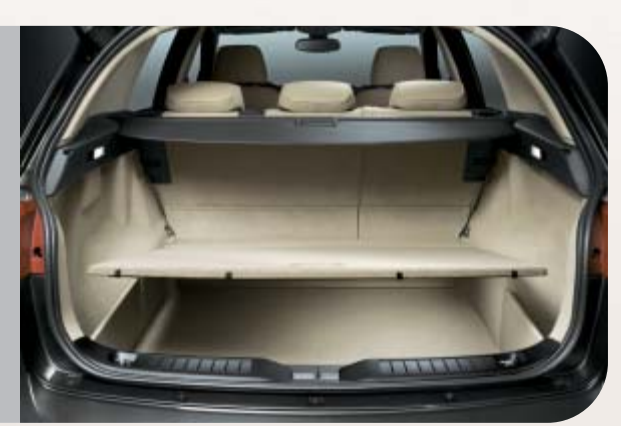
Double luggage compartment that creates extra space.

The new Croma's luggage compartment isn't just big, it's also extremely versatile. The 500 litres of space increases to 1610 litres when the rear seats are folded. And the magic touch? An ingenious double luggage compartment that creates a secret space for valuables and a 'new' floor at seat level for stowing luggage on a flat surface.