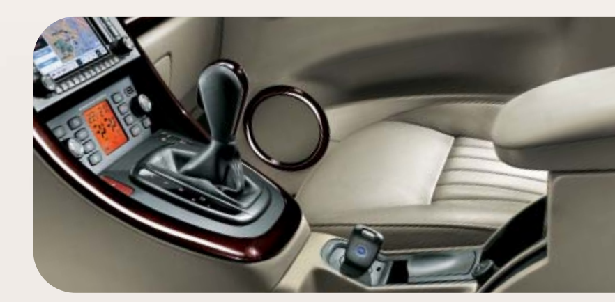
Centrally placed ergonomic console.

There is a choice of transmissions to precisely match your driving style. Petrol engines can be specified with 5-speed manual or a sequential automatic. Diesel engines get a 6-speed manual or sequential automatic, which is the sole choice on the powerful 2.4 20v MultiJet.