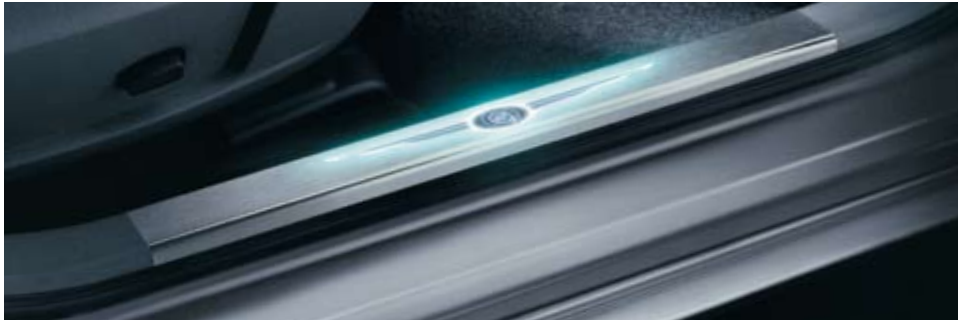
ILLUMINATED DOOR ENTRY GUARDS are constructed of weather-resistant stainless steel. Guards illuminate every time you open the door and shut off automatically with the dome light. Like all Chrysler electronic accessories, they won't drain your battery under normal conditions. Set of two. Front only. Also available with SRT8 logo. (Becoming available during 2006).