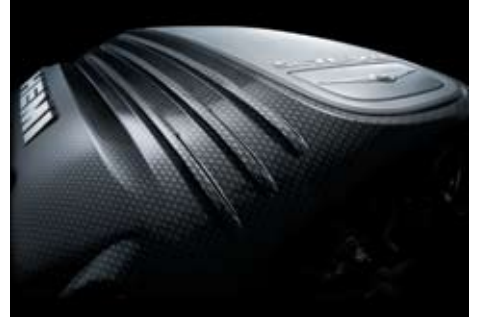
HEMI® ENGINE COVER takes a not-so-subtle approach when it comes to displaying your HEMI® engine. Available in bold, street HEMI® Orange or Black carbon fibre-style designs.