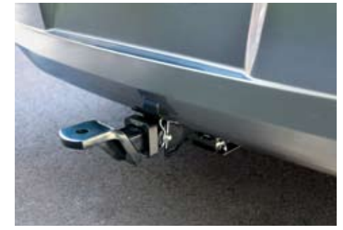
TOW BAR* comes as a complete towing solution. Tow bar is rated to a maximum towing capacity of 1,725kgs. Kit includes tow bar, tongue, tow ball and wiring harness.