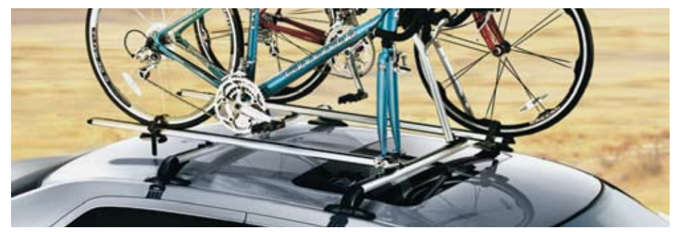
ROOF-MOUNT BIKE CARRIERS <sup>#</sup> are made of brushed aluminium and are designed to accommodate virtually all types of bikes. The Fork-Mount style carries one bike securely by the front fork and rear wheel. The Upright style carries one bike locked by the frame with both wheels secured. Carrying clamps feature extra-large rubber inserts to help protect bike surfaces. Designed for use with Removable Roof Rack (sold separately).