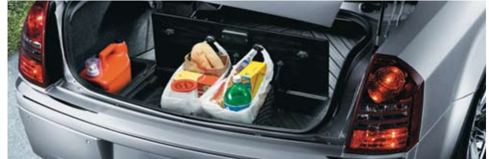
CARGO ORGANISER<sup>#</sup> can be utilised as either a handy cargo tray or divided organiser. Features integrated organiser with lid, adjustable net partitions (for up to four compartments) and grocery bag hooks. Includes Moulded Cargo Tray.

*Do not exceed rated tow capacity of the vehicle as equipped. Towing may require some items not supplied by DaimlerChrysler. *Skis, bikes and cargo are for illustrative purposes only and are not included with the listed accessories. *Properly secure all cargo. HE/MI is a registered trademark of DaimlerChrysler Corporation.