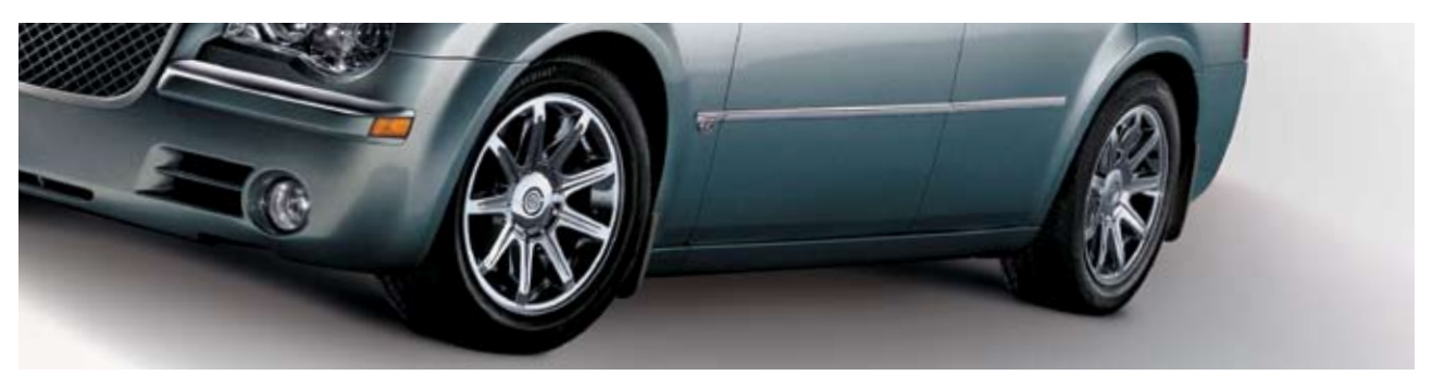
WHEEL LOCKS include four new lug nuts and a special fitting key to offer maximum wheel and tyre theft protection. Sold in sets of four.