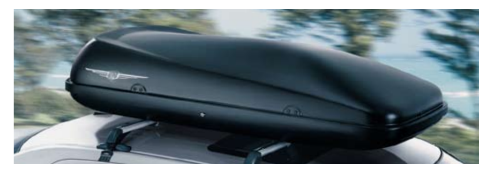
REMOVABLE ROOF RACK <sup>#</sup> increases the cargo capacity of your vehicle. Accommodates Roof Box Cargo Carrier , Roof-Mount Ski and Snowboard Carriers , Roof-Mount Bike Carriers and Roof Top Cargo Carrier . ROOF BOX CARGO CARRIER helps keep cargo dry and secure in any weather. Tough, lockable thermoplastic carrier features quarter-turn installation and gas-cylinder opening system that allows the hinged lid to open and close gently. Features the Chrysler Winged Badge and mounts to the Removable Roof Rack . Available in two sizes.