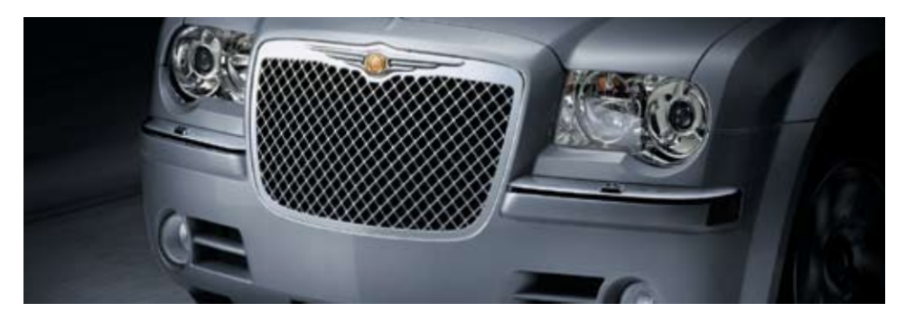
PREMIUM CHROME GRILLE adds a distinctly upscale accent to your 300C's front end. Designed to replace existing grille for a seamless, elegant appearance.