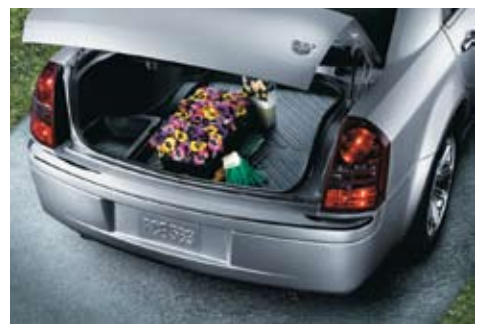
MOULDED CARGO TRAV<sup>†#</sup> fits in the rear cargo area to help protect carpeting. Includes two side cargo bins to help secure smaller items. Removes easily for cleaning and features skid-resistant bottom.