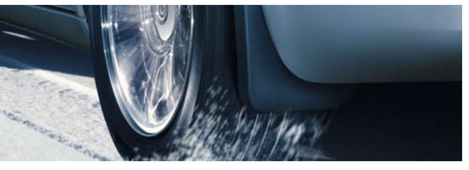
MOULDED SPLASH GUARDS help protect your Chrysler 300C from damage caused by gravel and road debris. Available in a set of two for front and rear wheel wells.