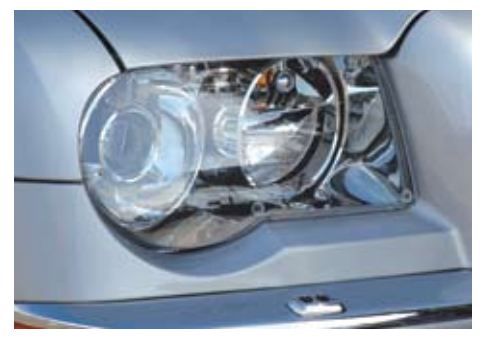
HEADLIGHT PROTECTORS help protect your headlights from damage caused by gravel and road debris as well as protecting them from dirt and bugs. With a seemless fit they add protection without detracting from the look of the vehicle.