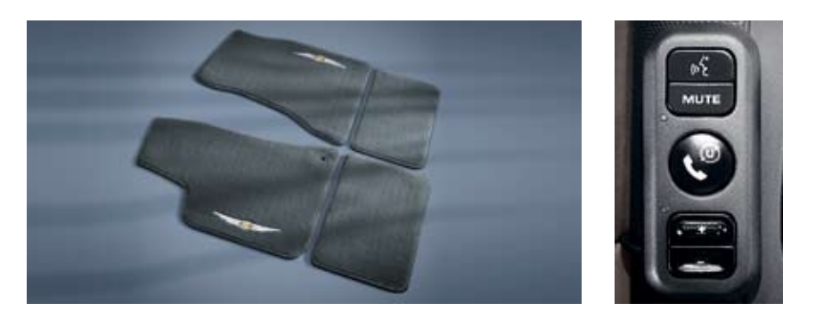
PREMIUM FLOOR MATS feature plush nylon carpet. Rubbernibbed backing with driver's side positive retention helps keep mats in place.

UCONNECT™ HANDS-FREE COMMUNICATION is an exclusive, voice-activated, hands-free, in-vehicle communication system that utilises a small control pad, microphone and speaker. It encourages safe vehicle operation and doesn't compromise driver control. UConnect allows you to dial a mobile phone through simple voice commands. In addition, UConnect mutes your radio before receiving or sending a call, allows you to store up to 32 names (four numbers per name) in the system's address book, and is flexible enough for an entire family (up to five phones can be linked to the system). UConnect includes Bluetooth® technology that enables a mobile phone to connect to your vehicle without wires or a docking station. This leading-edge technology will allow you to store a mobile phone anywhere within the vehicle. UConnect is simple to use — all you need is a Bluetooth Hands-Free Profile mobile phone from any mobile carrier.<sup>§</sup>