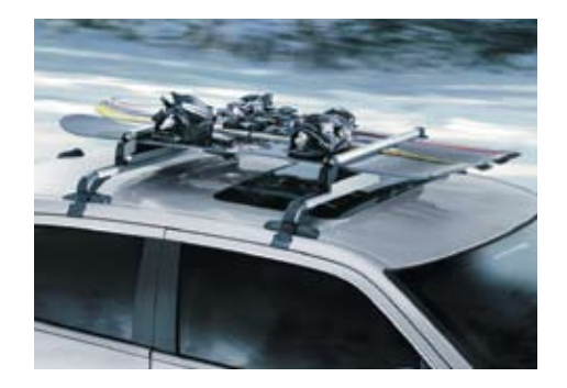
SIX-PAIR SKI AND SNOWBOARD CARRIER<sup>#</sup> holds up to six pairs of skis or four snowboards, or a combination of the two. Features silver anodised aluminium construction, corrosion-resistant lock covers and either-side opening for easy loading and unloading. Mounts to Removable Roof Rack (sold separately).