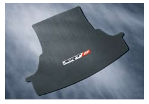
PREMIUM CARPET CARGO MAT is constructed of the same plush nylon carpet found in our best floor mats and features the SRT8 logo. Premium mat also features reversible rubber backing for added versatility. Available in Black. (Becoming available during 2006).