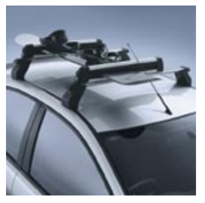
> Ski/snowboard carrier. A snow adventure is only moments away with this specially designed ski/snowboard carrier.