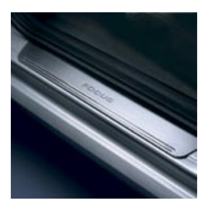
> Scuff plates. Add the finishing sporty touch with brushed aluminium scuff plates. Embossed with the Focus logo.