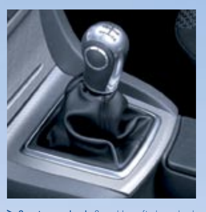
> Sports gear knob. Superbly crafted gear knob helps give the interior of your Focus an even sportier look and feel (manual transmission only).