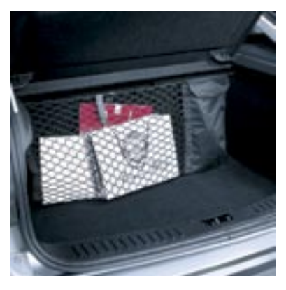
> Cargo swing net. Keep your belongings in place. Easy to install and remove, it attaches to the sides of the cargo area to help prevent loose items moving around during transit.