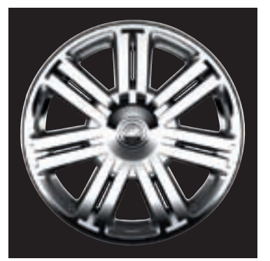
A 17-inch Aluminium Wheel