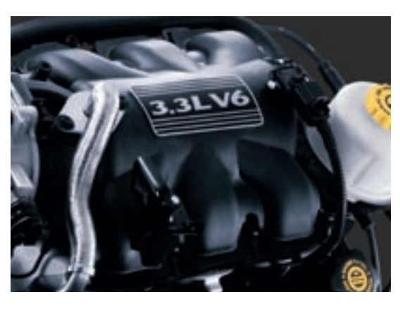
S = Standard.