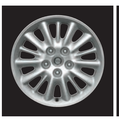
B 16-inch Constellation Aluminium Wheel