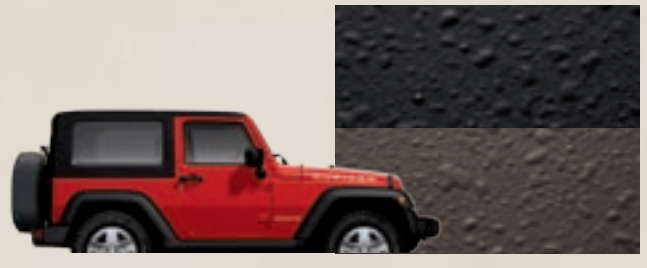
Freedom Top™ Hardtop – Available on Wrangler and Wrangler Unlimited (not shown) in Black | The strong and secure hardtop offers solid protection from the elements and helps quiet your ride. Enjoy the best of both hardtop and soft top worlds when you choose the Dual Top option.