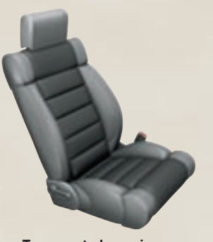
Everest/Wallace II Cloth, Two-Tone seat shown in Medium Slate Grey, also available in Medium Khaki | Standard on Wrangler Sport and Wrangler Unlimited Sport