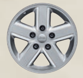
16-inch Tech Spoke Cast-Aluminium painted Sparkle Silver | Standard on Wrangler Sport and Wrangler Unlimited Sport