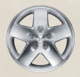
17-inch Moab Cast-Aluminium with machined face | Standard on Wrangler Rubicon and Wrangler Unlimited Rubicon