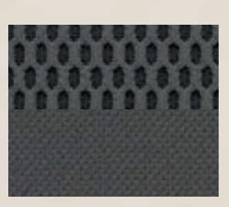
Canyons/Racine Cloth with YES Essentials® Seat Fabric, Two-Tone seat shown in Medium Khaki, also available in Medium Slate Grey | Standard on Wrangler Rubicon and Wrangler Unlimited Rubicon