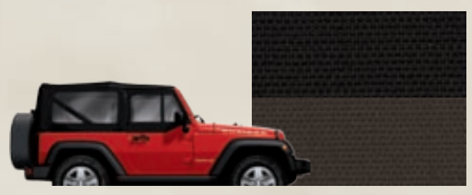
Sunrider® Soft Top – Standard on Wrangler and Wrangler Unlimited is a sailcloth soft top in Black | Utilises a special three-ply material that is quiet, watertight and easy to fold and tuck away. "Late availability.

Premium Wheels from Genuine Jeep Accessories