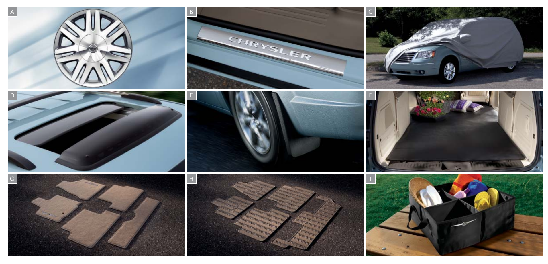
A. 17-INCH CHROME CLAD ALUMINIUM WHEEL. Put a new spin on style. This premium wheel is machined to match your vehicle's exact specifications for a balanced ride and undergo stringent testing for optimal durability and long-lasting shine. It also gives your Grand Voyager a custom look that will make it even more compelling. B. DOOR SILL GUARDS. Protect front door sills from scratches. Brushed stainless steel guards are embossed with the Chrysler name. C. FULL VEHICLE COVER. Protect your vehicle's finish from UV rays, dirt and other pollutants with this washable, weather-resistant heavy-duty cover. Custom-contoured cover features double-stitched seams and elasticised bottom edges at the front and rear. D. SUNROOF AIR DEFLECTOR. Helps keep wind noise to a minimum and directs air and debris up and over your sunroof opening when the vehicle is moving. E. MOULDED SPLASH GUARDS.(1) Help protect the your vehicle from damage caused by gravel, salt and road spray. Sets of two for front and rear. F. REAR FLOOR LINER. Soft black vinyl liner covers the entire floor or folds to cover partial floor areas. For any Stow 'n Go® second or third-row seating combinations. Attaches to floor hooks behind front-row seats. G. PREMIUM CARPET FLOOR MATS.<sup>(2)</sup> Custom-fit, durable nylon mats feature rubber-nibbed backing to help keep them in place. Colour matched to your vehicle's interior. Front, middle and rear mats available separately. H. SLUSH MATS.<sup>(2)</sup> Feature deep grooves to help prevent water, snow and mud from spilling onto the carpet. Nibbed backing with driver's side positive retention help keep mats in place. I. CARGO TOTE.(3) Collapsible tote features a skid-resistant bottom, divided storage compartments and is easy to clean.