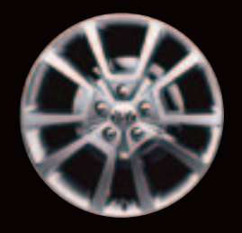
18-inch polished aluminium wheel

The SXT comes with a 2.0-litre engine which has 115kW @ 6300 rpm and 190 N.m of torque @ 5100 rpm.