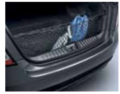
Cargo swing net. Keep your belongings in place. Easy to install and remove, it attaches to the sides of the cargo area to help prevent loose items moving around during transit.