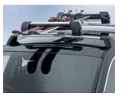
Ski/snowboard carrier. * Lockable with soft rubber padding to help prevent damage to skis. Accommodates up to 5 sets of skis.