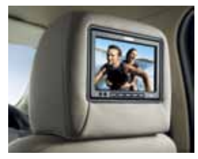
Futuris rear headrest DVD system. This DVD system includes two wireless headphones, and features built-in FM modulator and auxiliary input. The viewing angle is also fully adjustable to cater for children of all ages.