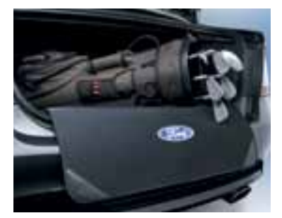
Boot scuff guard. Designed to protect your Falcon's rear bumper and boot lip from scratches and scuffs when loading and unloading. Folds neatly away when not in use.