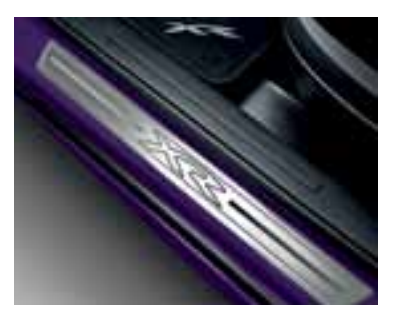
Scuff plates. Enhance the appearance of your Falcon with these stylish alloy scuff plates. Available as a set of two front scuff plates featuring either the 'Ford' or 'XR' logo.