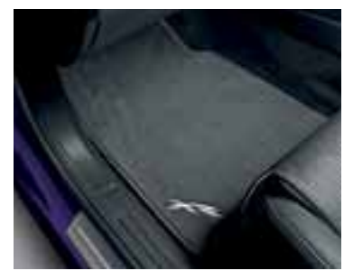
Carpet mats.* Featuring the 'Ford', 'XR' or 'G Series' logo, these stylish mats are easy to remove and clean. Anchor points fix the driver's mat to help prevent movement.