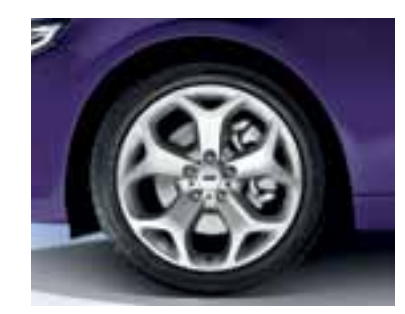
18" x 8" XR 5-spoke alloy wheels.