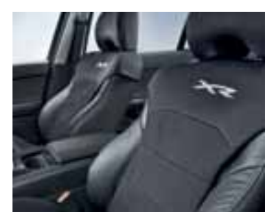
XR waterproof seat covers. Help protect your seat fabric from dirt, sand, liquids and everyday wear and tear with these cleverly designed neoprene covers.