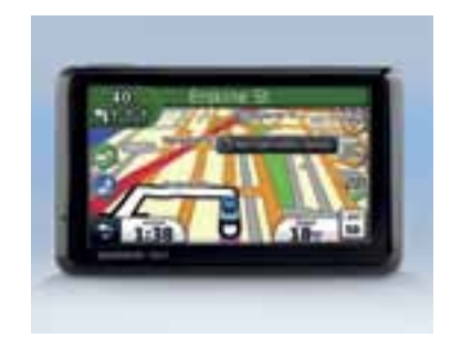
Garmin Nüvi portable Satellite Navigation Systems.<sup>^</sup> The easy-to-read navigation systems give you clear directions to your destination. Garmin Nüvi 1390T portable satellite navigation system shown. Suna Traffic included.<sup>^</sup>