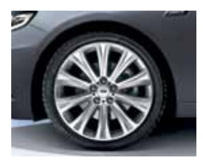
19" x 8" G Series 10-spoke alloy wheels.†