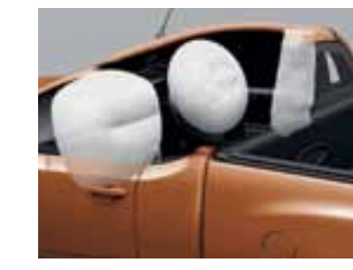
Driver, passenger and side head/thorax airbags