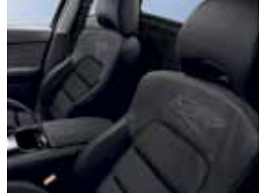
50<sup>th</sup> Anniversary embossed leather trim seats on XR6 Ute