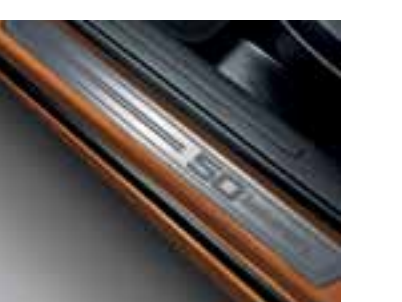
50<sup>th</sup> Anniversary scuff plates and carpet mats