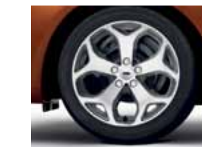
Unique 18" alloy wheels on XR6 50<sup>th</sup> Anniversary