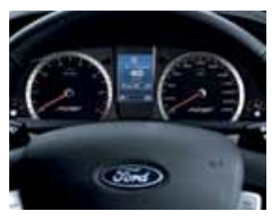
Instrumentation with 'XR50' graphics and dual zone climate control