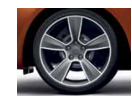
Unique 19" alloy wheels on XR6 Turbo 50th Anniversary